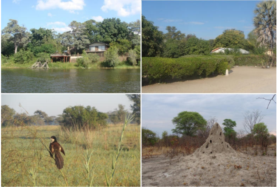
Figure 1. Habitats in Katima Mulilo.