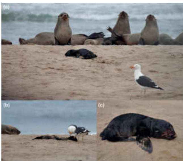
Figure 2: Behavioural ethogram describing kelp gull predatory behaviour on Cape fur seals in southern Namibia: (a) gulls approach small, weak, or wandering juvenile or newborn seals; (b) gulls first target the ocular regions of live or dying seals; (c) still-alive seal pup with its right eye ripped out by a gull attack

et al. 1998; Sironi et al. 2009). The proportion of whales exhibiting gull-induced wounds in this area has increased from 1% in 1974 to nearly 80% in 2008 (Sironi et al. 2009).