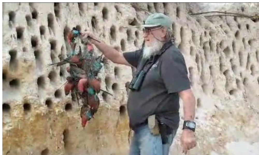
Figure 2: Entangled Southern Carmine Bee-eaters being collected.