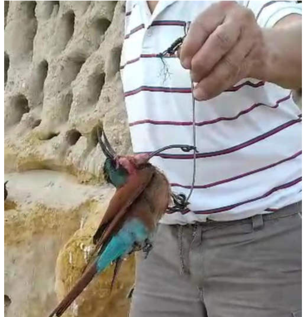
Figure 4: Homemade snap-traps were also used to capture Southern Carmine Bee-eaters.