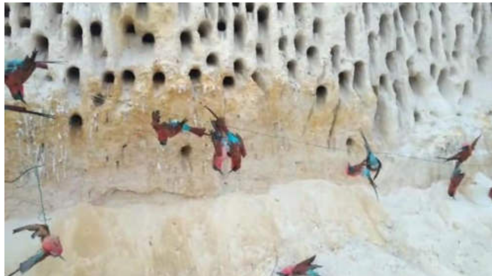
Figure 1: Southern Carmine Bee-eaters Merops nubicoides entangled in fishing net placed over the nesting holes.

Evidently the birds were not captured and killed for food or trade since the nets were never checked or emptied of trapped birds which were merely left to die but rather viewed as senseless mischievous entertainment (pers. obs). Donald et al. (2024) confirmed the low prevalence of trade in the species. However, in Zimbabwe some colonies along the Zambezi River (outside of national parks) had