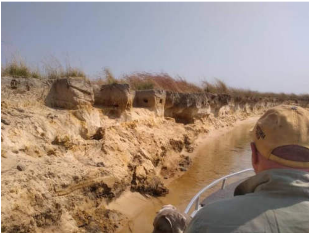
Figure 5: Excavated river bank at nesting colony of Southern Carmine Bee-eaters. Compare this to the bank with intact nest tunnels in Figures 1 & 2.

been exploited for food to the point of extinction (Barnes & Herremans 1997) indicating the severity of such direct persecution by humans of the species. As Southern Carmine Bee-eaters show site fidelity (Fry 1984) it would be easy to eradicate a known breeding population, especially if the sandy river banks are purposefully destroyed or the breeding process disturbed. Simmons et al. (2025) recommends that monitoring and protection of known breeding colonies takes place to ensure that the conservation status is not downgraded in future.