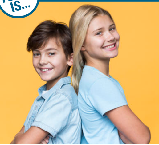
The bond between siblings is extra-special, even more so if one of them has a life-long illness or a disability. Sibling Day is a way of honouring that special bond.