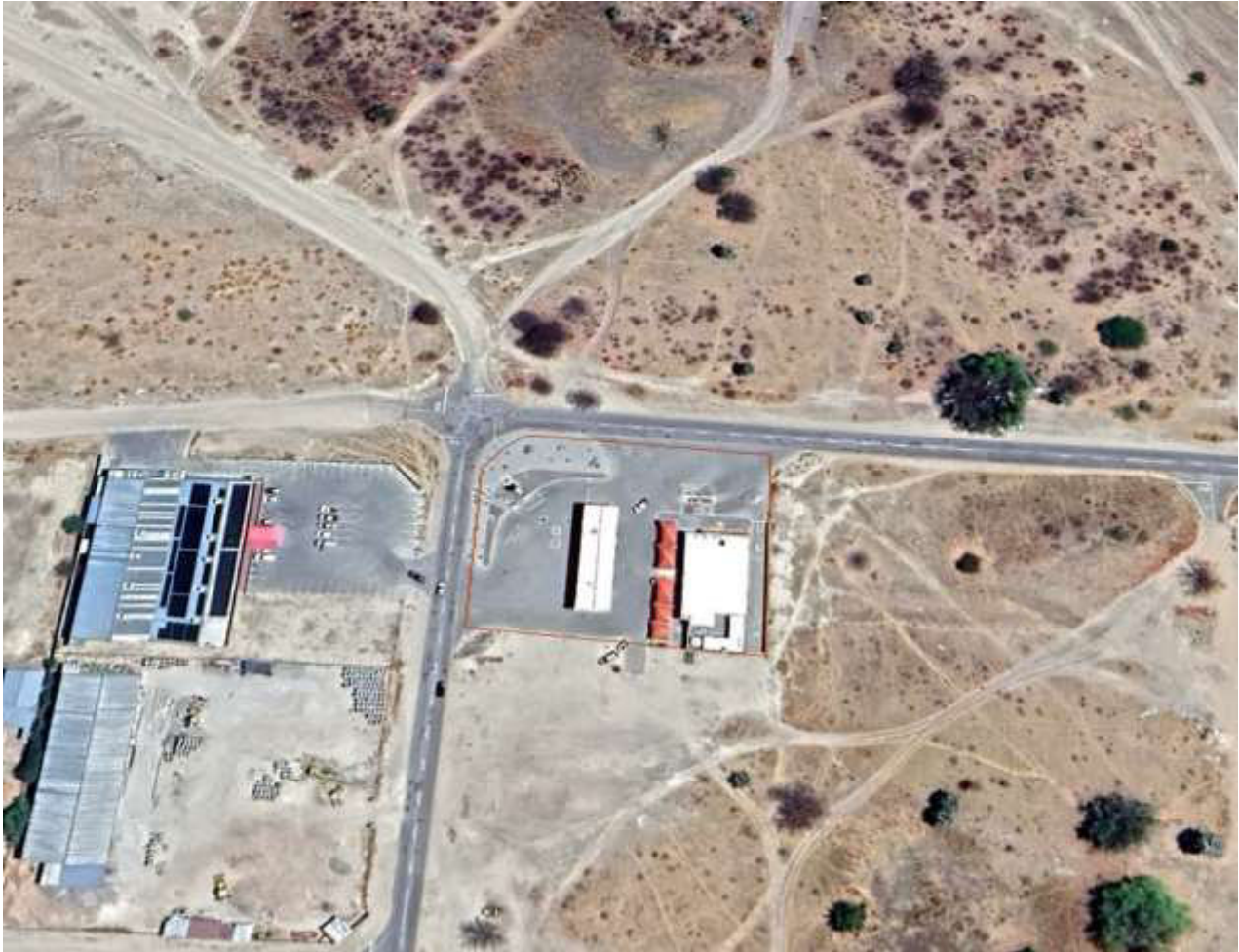
Figure 2. Layout of the site