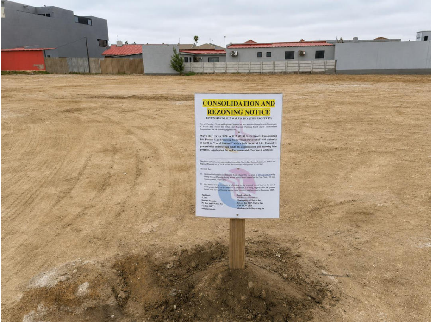
Figure 3: Notice board on-site (Erven 3120, 3121 & 3122 Walvis Bay) zoomed out.