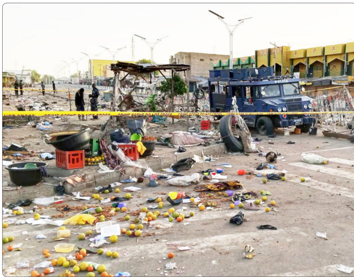
Horrific... Police officers at the market after the explosion in Maiduguri.

Borno state governor Babagana Zulum called the apparent bombings "barbaric" and said "the recent surge in attacks is not unconnected with intense military operations in the Sambisa forest", which has a reputation as a jihadist stronghold.