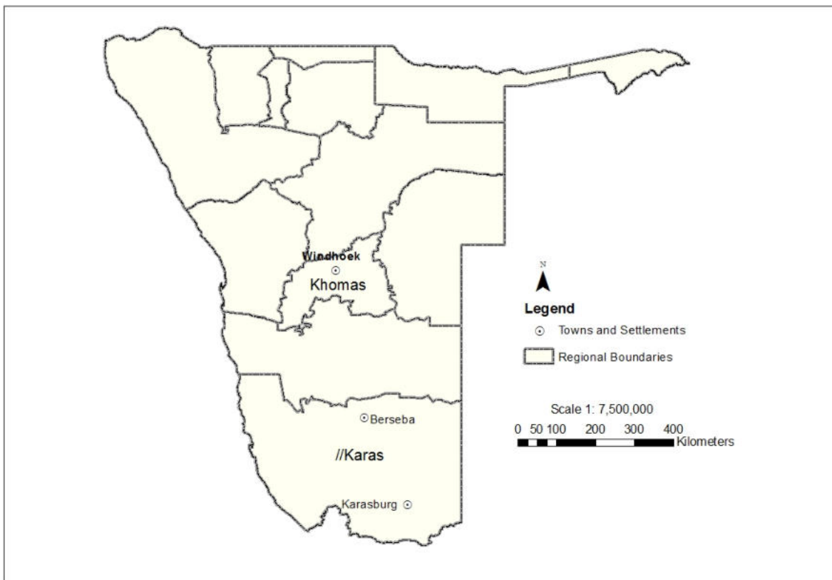
Figure 1: Berseba Location Map Coordinates: -25.99531; 17.76650

The ESMP is for an existing scheme and it is therefore only for the continuation of operation and maintenance of the scheme.