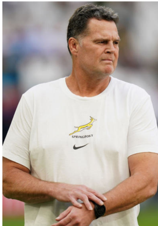
Genius... South Africa head coach Rassie Erasmus.

"They still have the same strengths, which they've developed even further; In those sectors, they performed better than us, once again. They're a great team," Galthie said. - SuperSport