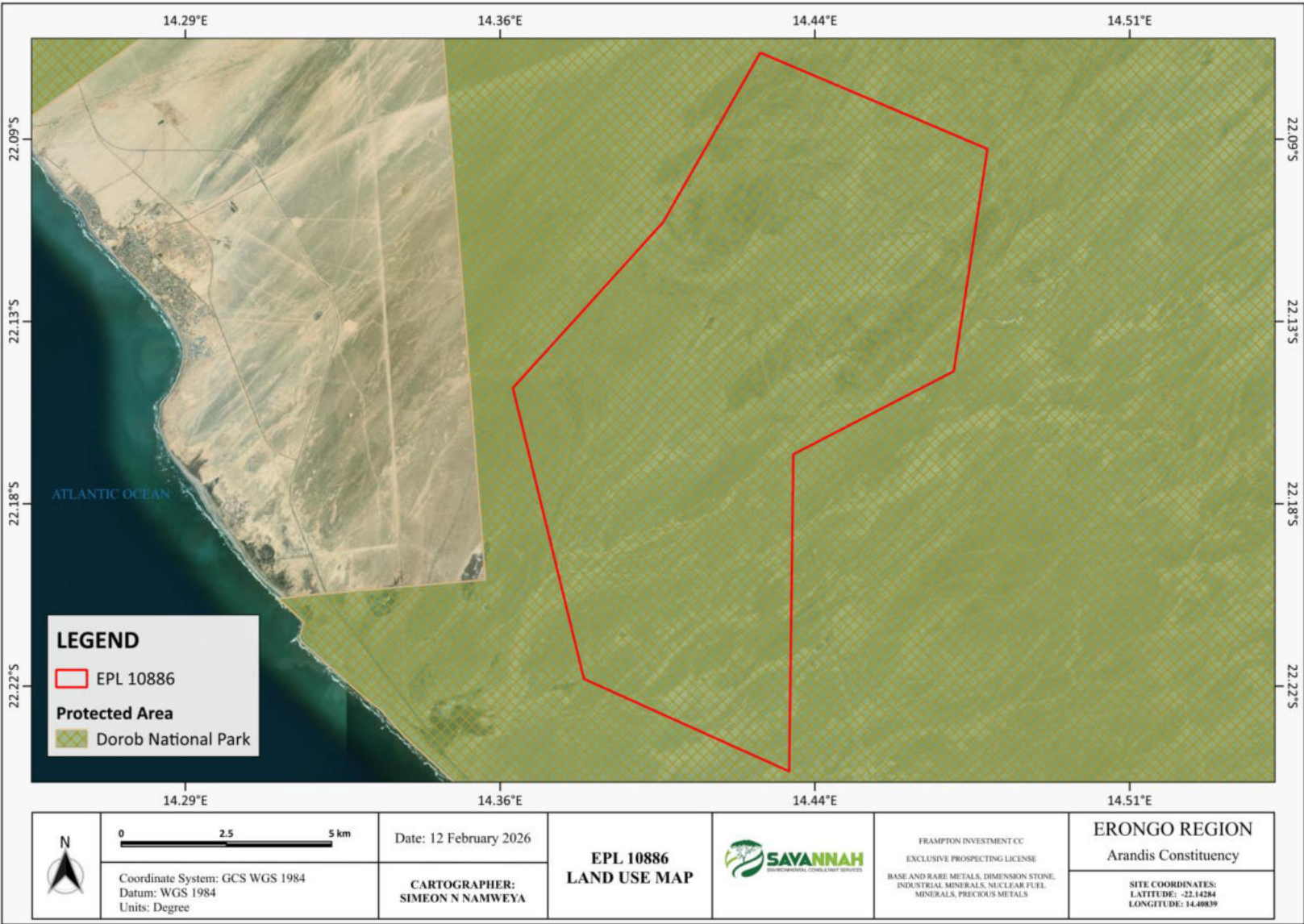
figure 2 The land use map around the proposed site