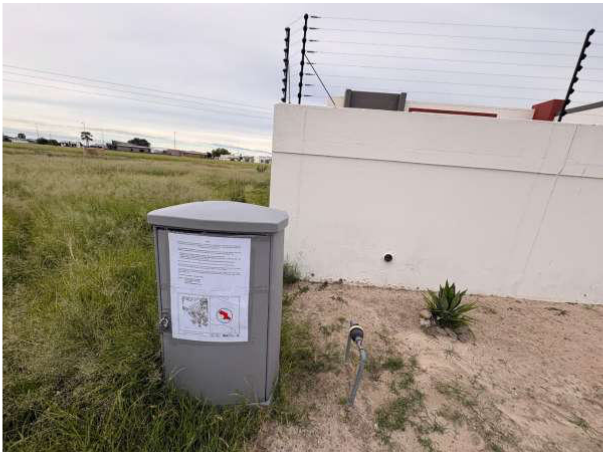
Figure 2: Municipal services on site

Any additional infrastructure upgrades or betterment costs arising from the development shall be for the account of the developer.