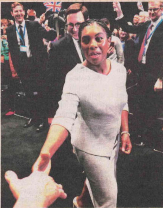
Political contest... Britain's main opposition Conservative Party leader Kemi Badenoch shakes hands with delegates after delivering her speech on the final day of the annual Conservative Party conference in Manchester, north-west England, yesterday.