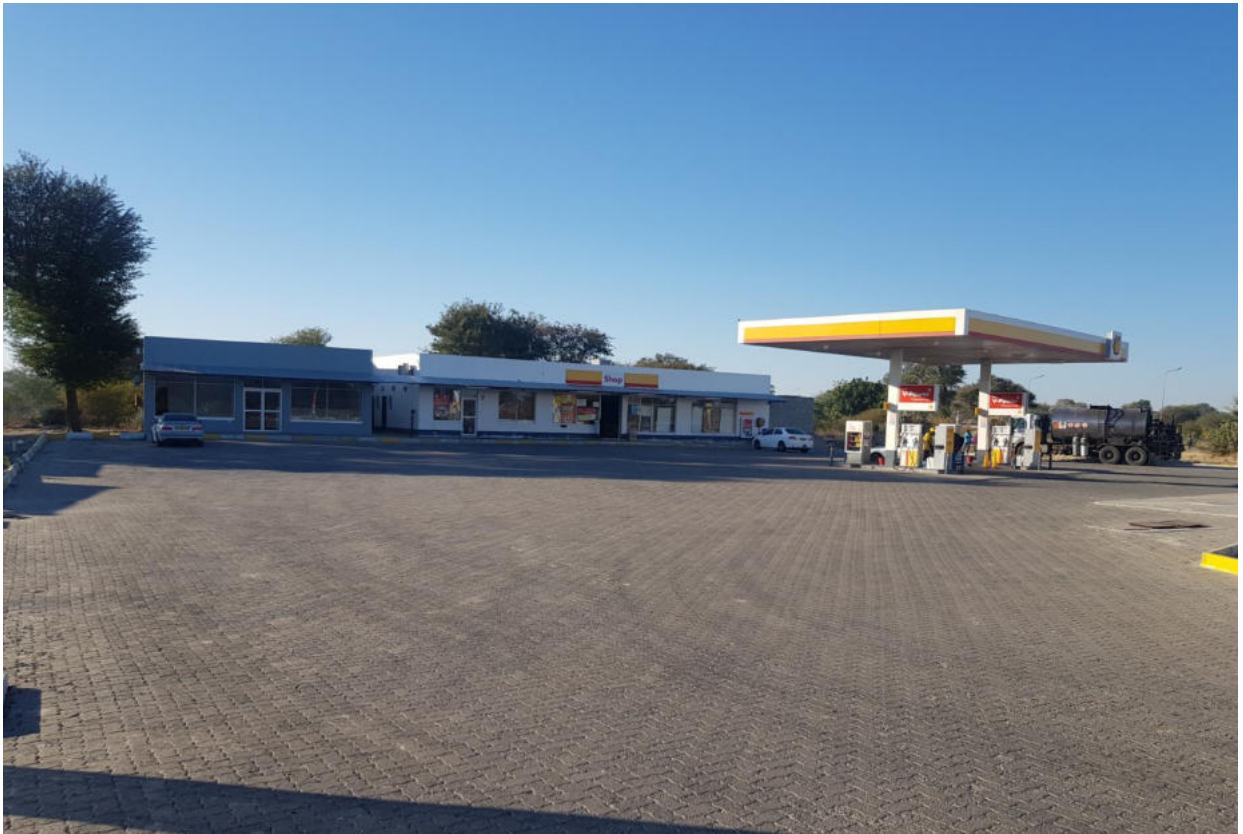
Photo 1. The existing Bukalo Service Centre .

Conveniently located in the townlands of Bukalo , at the corner of B8 and D3510 road, the Service Station offers a convenience store. See the photo below for the site layout.