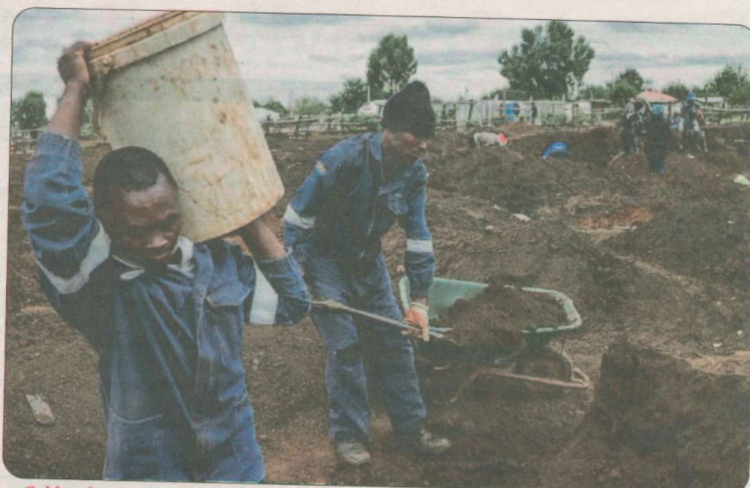
Gold rush... Dozens of fortune-seekers have flocked to the township of Springs.