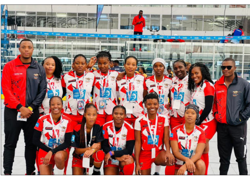
Unity... Otjiwarongo Nampol Volleyball Club.

Only shortlisted candidates will be contacted Closing date: 31 October 2025