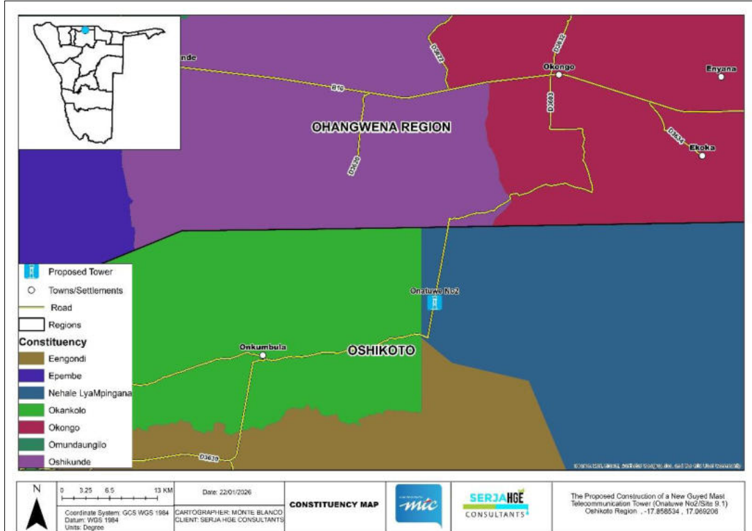
Figure 2: The Onatuwe No. 2 Site position on the constituency map (in the Nehale LyamPingana Constituency)