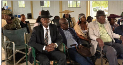
Terugkerendes van Botswana vergader by Gam en berei voor vir hul hervestiging na permanente by Otjipahewa.