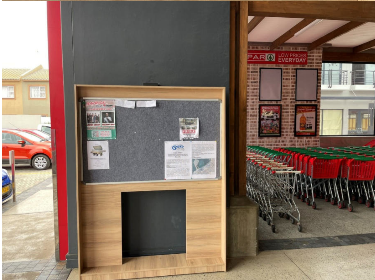
Site Notice as Woermann Brock Walvis Bay