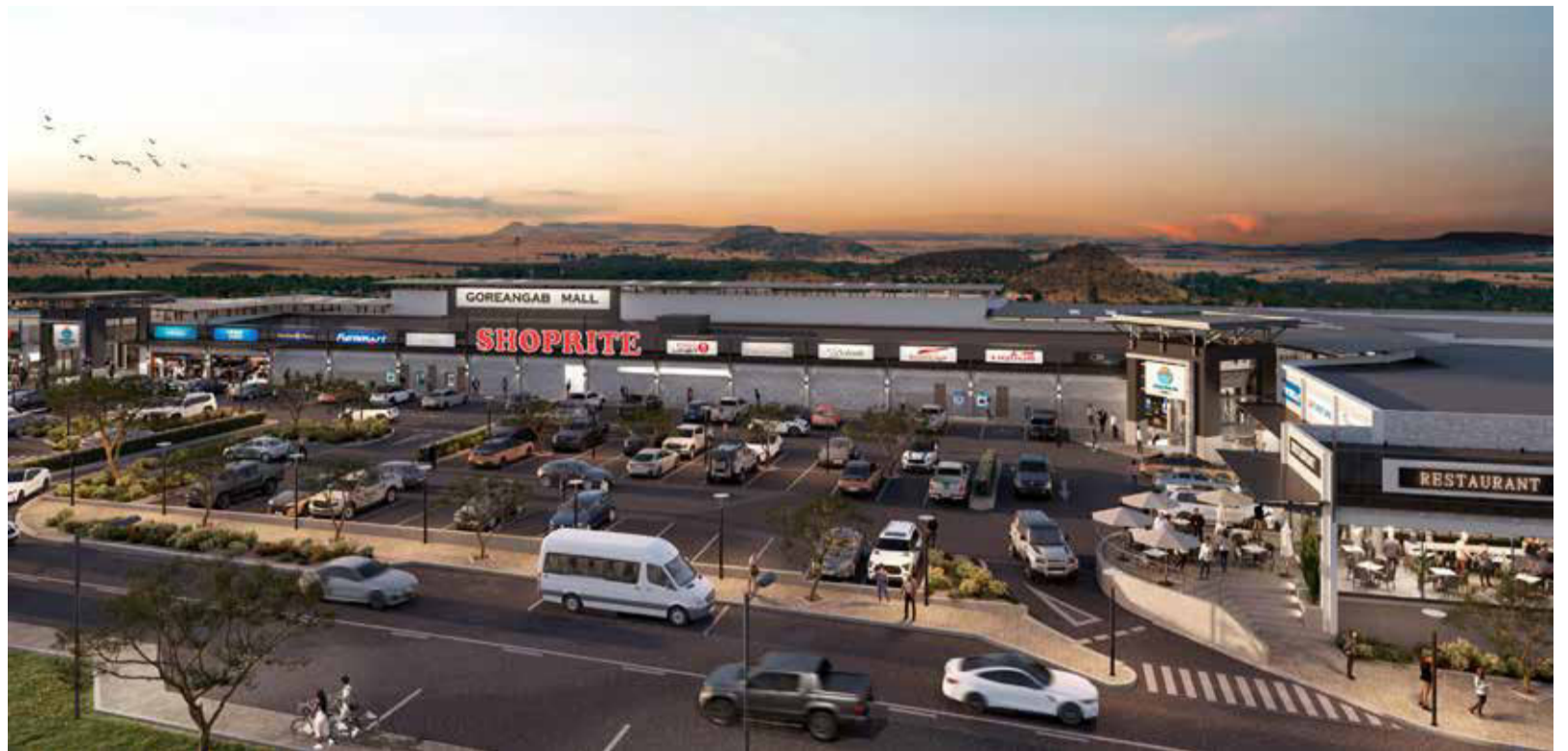
Oryx Properties is busy with the Goreangab Mall development, a first-of-its-kind project in the Katutura area scheduled for completion in May 2026.