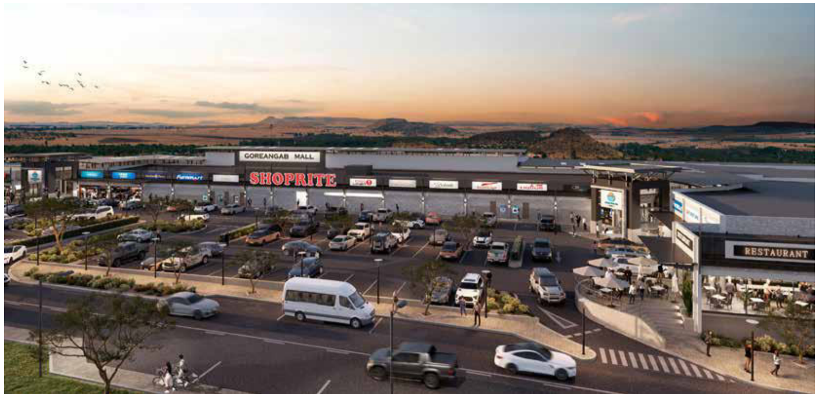
Oryx Properties is busy with the Goreangab Mall development, a first-of-its-kind project in the Katutura area scheduled for completion in May 2026.