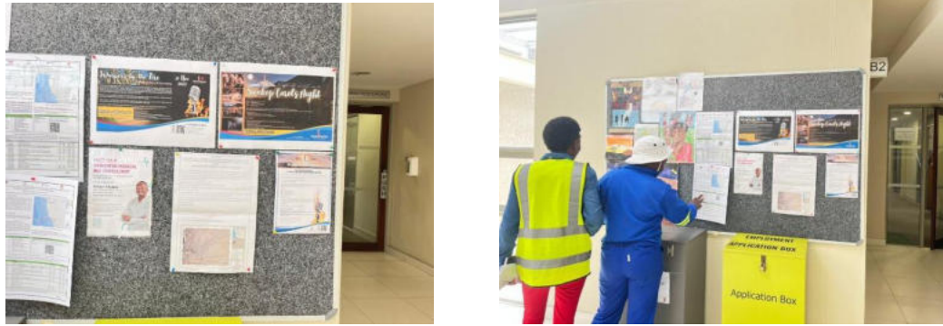
Figure 6: Site Notices at Swakopmund Municipality Notice board