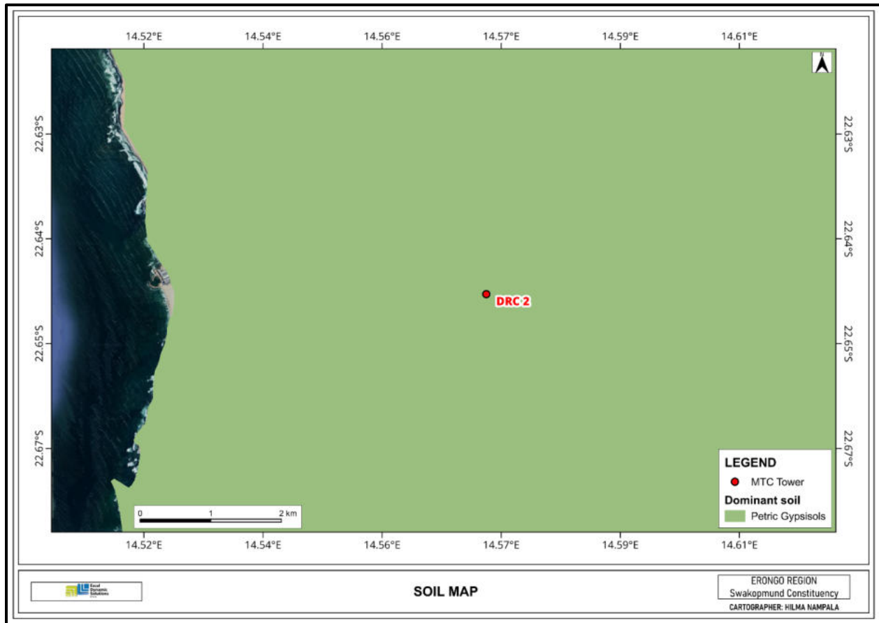
Figure 5: The Soil map around the proposed site