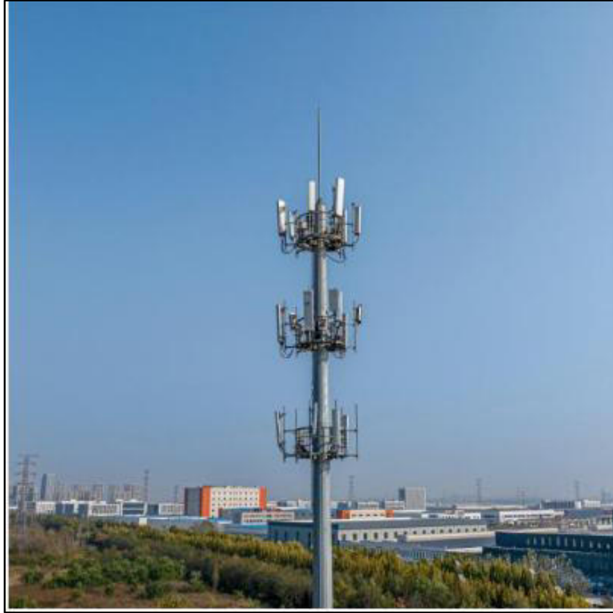
Figure 2: A typical 25m Monopole tower structure