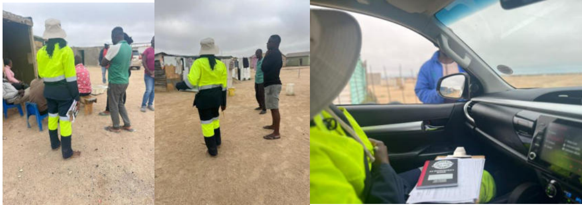
Figure 7: House to house consultation held