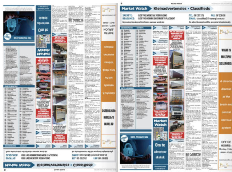
Figure 1: Newspaper adverts on 21 st and 28 th January 2025