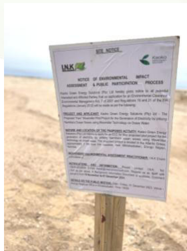
Notice to adjacent plot owners

A notice was placed on site to notify the adjacent land/plot owners of the activities. The adjacent land is open and vast land/plots with no infrastructure or immediate and adjacent neighbors.