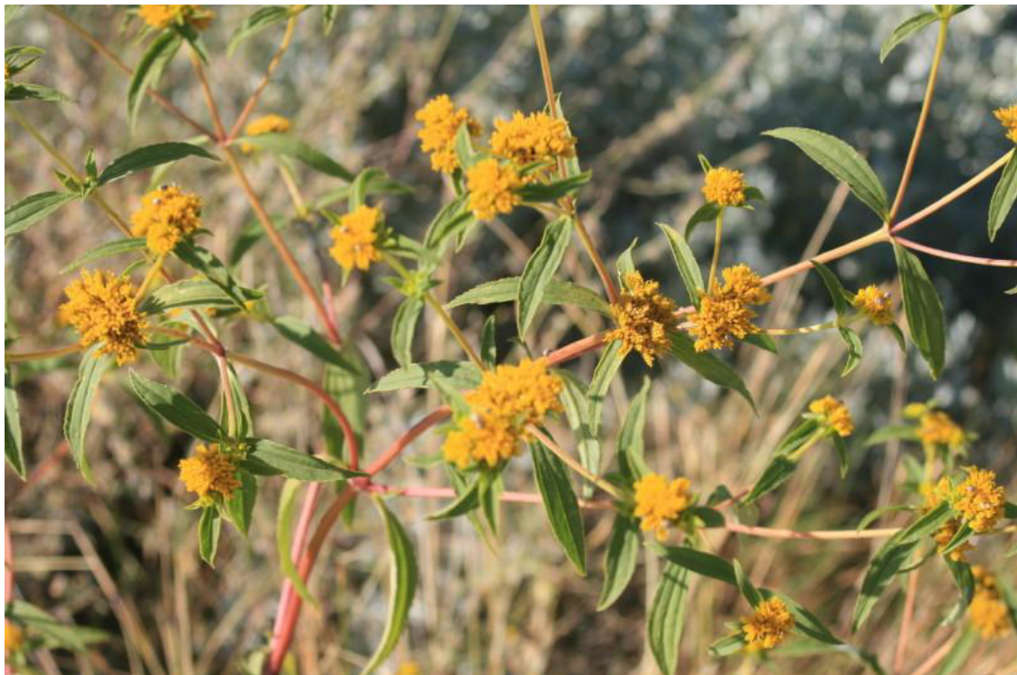
Figure 5. Flaveria bidentis (smelter's bush) observed under the line.