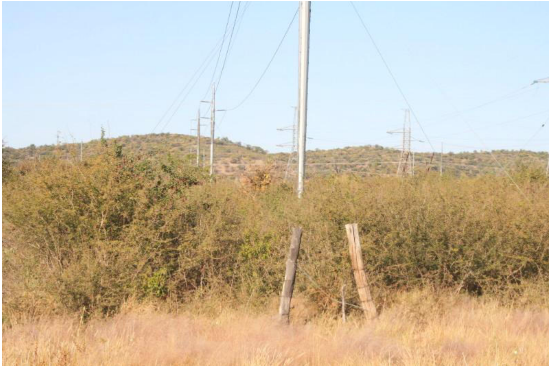
Figure 2. Dense stands of Dichrostachys cinerea (sicklebush) in the Otjikoto Substation area.