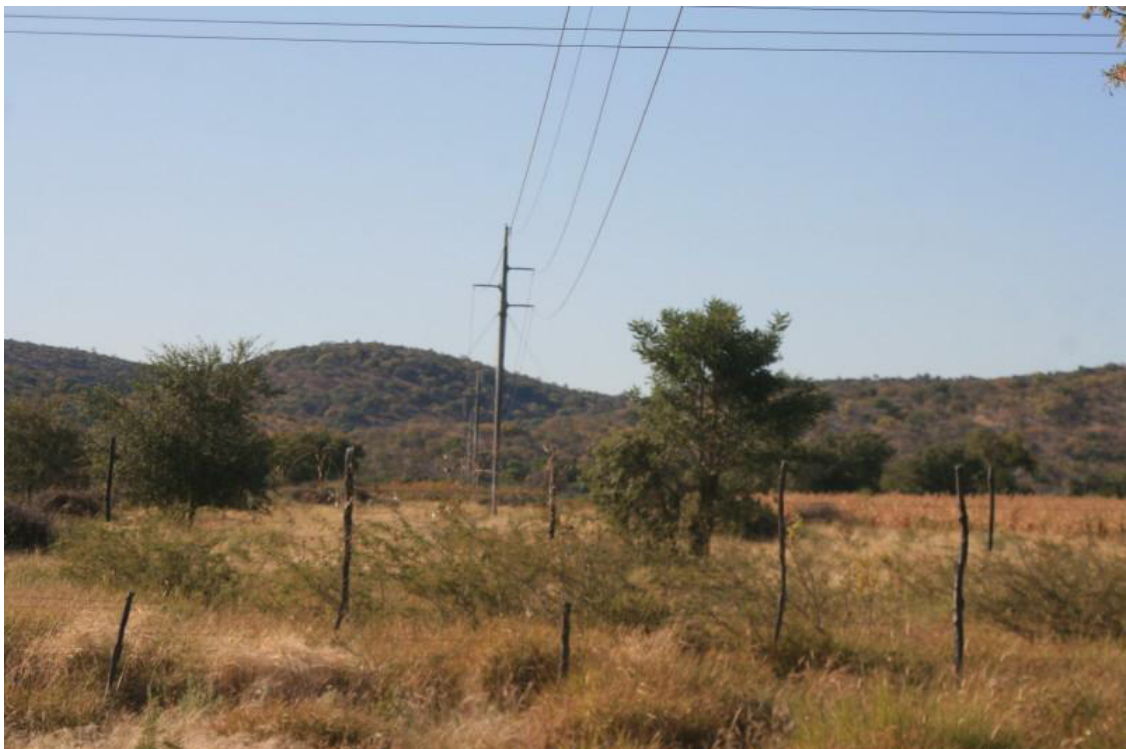
Figure 7. There are no unique habitats along this route.