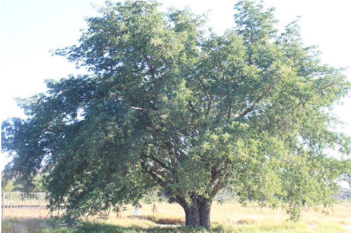
Figure 4. Sclerocarya birrea (marula) are important fruit trees throughout the area.