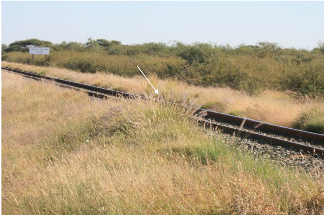
Figure 6. Pennisetum setaceum (fountain grass) (see arrow) observed along route.