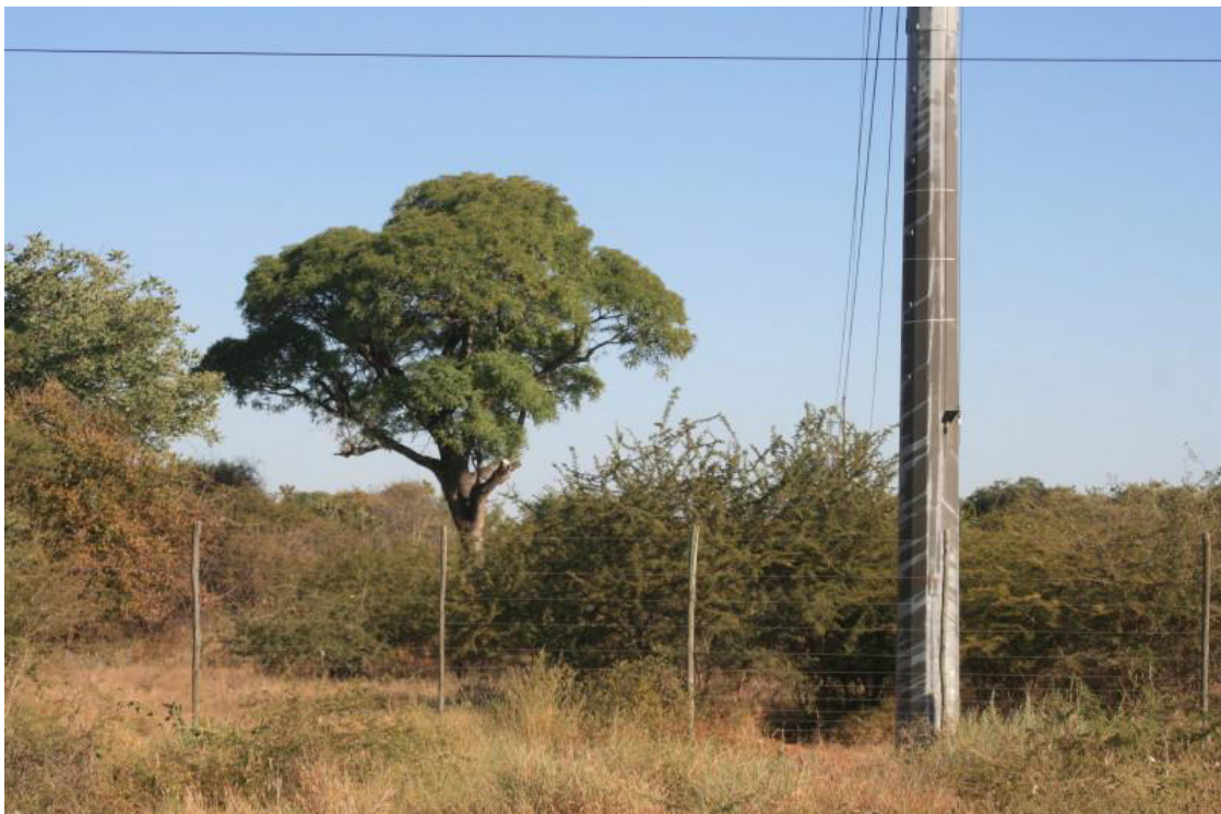
Figure 3. Dichrostachys cinerea (sicklebush) dominant with some large Kirkia acuminata (mountain syringe) trees.