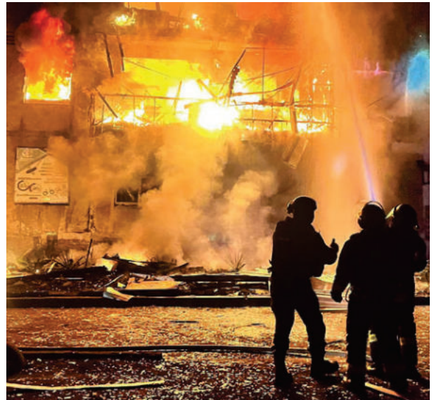
Deadly... An attack on Ukraine's eastern Donetsk region has resulted in the death of at least 20 people.

Any objection or written submission in terms of section 28 of the Act in relation to the applicant must be sent or delivered to the Secretary of the Committee to reach the Secretary not less than 21 days before the date of the meeting of the Committee at which the application will be heard