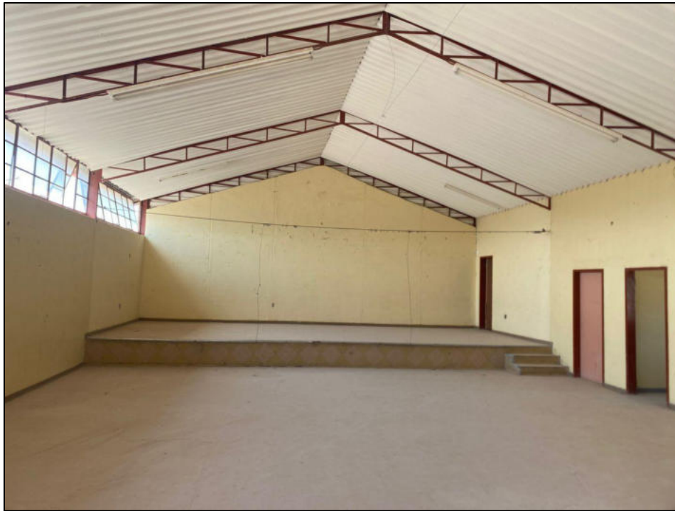
Figure 3: Public consultation meeting, no attendance, 18 October 2025, Hardap Region

Issues raised by I&APs have been recorded and incorporated in this environmental and social impact assessment report and the EMP. The summarised matters raised during the public meeting are presented in Table 6 below.