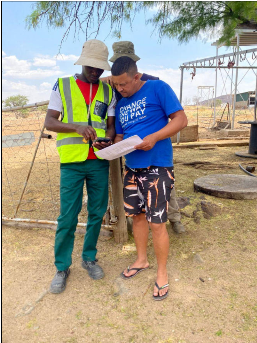
Figure 2: Farm to farm consultation, 17 October 2025, Hardap Region