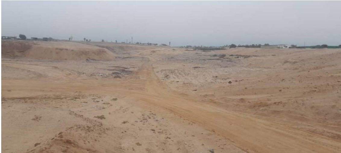
Figure 2: Decommissioned & Rehabilitated Building Rubble Dumpsite, Henties Bay, Namibia

This image depicts the current state of the site post-initial refilling with sand, showing rehabilitated areas. Coordinates: Centroid -22.107747, 14.283326 .