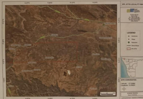
Locality map around EPL 9778

Excel Dynamic Solutions Environmental Impact Assessment & Environmental Management