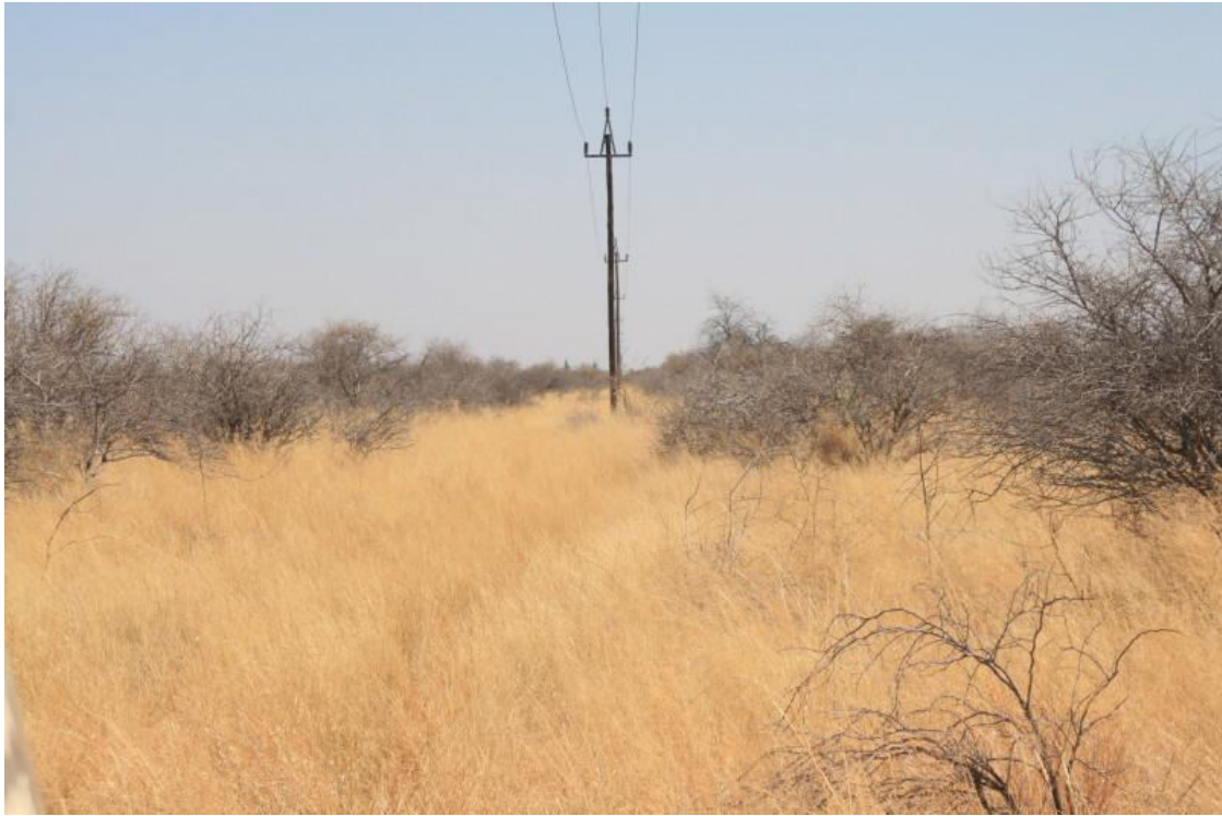
Figure 3. Numerous farmers have poisoned the Vachellia spp. with extensive areas covered by dead trees/shrubs along the route.