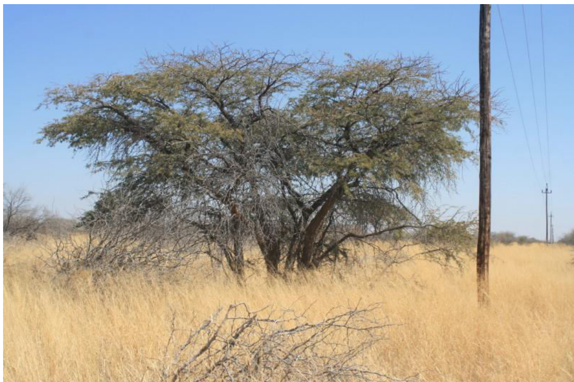
Figure 4. Vachellia erioloba (camel thorn) individuals occur along the line.