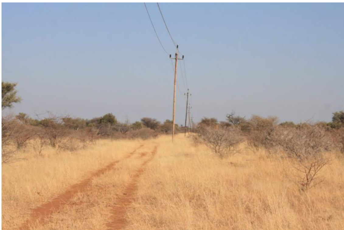
Figure 2. Acacia mellifera (black thorn) is the dominant shrub along this route.

The line passes through 0 “hotspot” areas, making the route viewed as low sensitivity, with no unique habitat. (Cunningham, 2022). Figure 2 – 6 show some of sensitive areas and the protected plant species found along and in the vicinity of the line servitude.