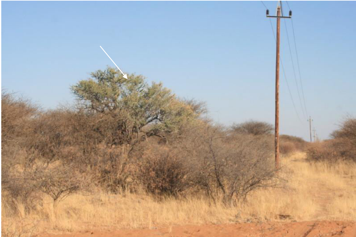
Figure 5. Boscia albitrunca (shepherd's tree) are the most common protected tree species along the route (See arrow).