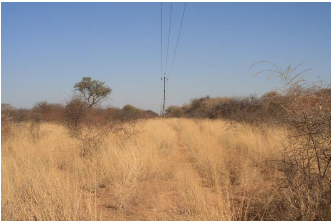
Figure 6. The entire route is viewed as “low” sensitivity – i.e. no unique habitats.