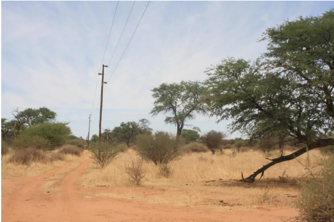
Figure 5. Large Vachellia erioloba (camel thorn) are typical of the Dordabis area.