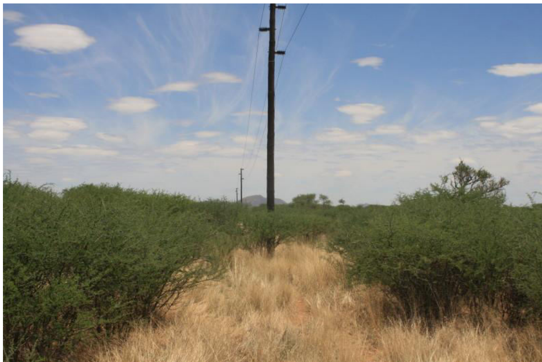
Figure 2. Dense patches of Vachellia mellifera (black thorn) occur in the Seeis Substation area.

The entire Seeis – Dordabis electrical reticulation route passes through three “hotspot” areas of which two are viewed as “high” sensitivity and one viewed as “medium” sensitivity, while the rest of the route is viewed as “low” sensitivity. The important areas along this line include Rocky hill area in the Farm Marula and others stated in the report, (Cunningham, 2022). Figure 2 – 7 show the sensitive areas and some of the protected plant species found along and in the vicinity of the line servitude.