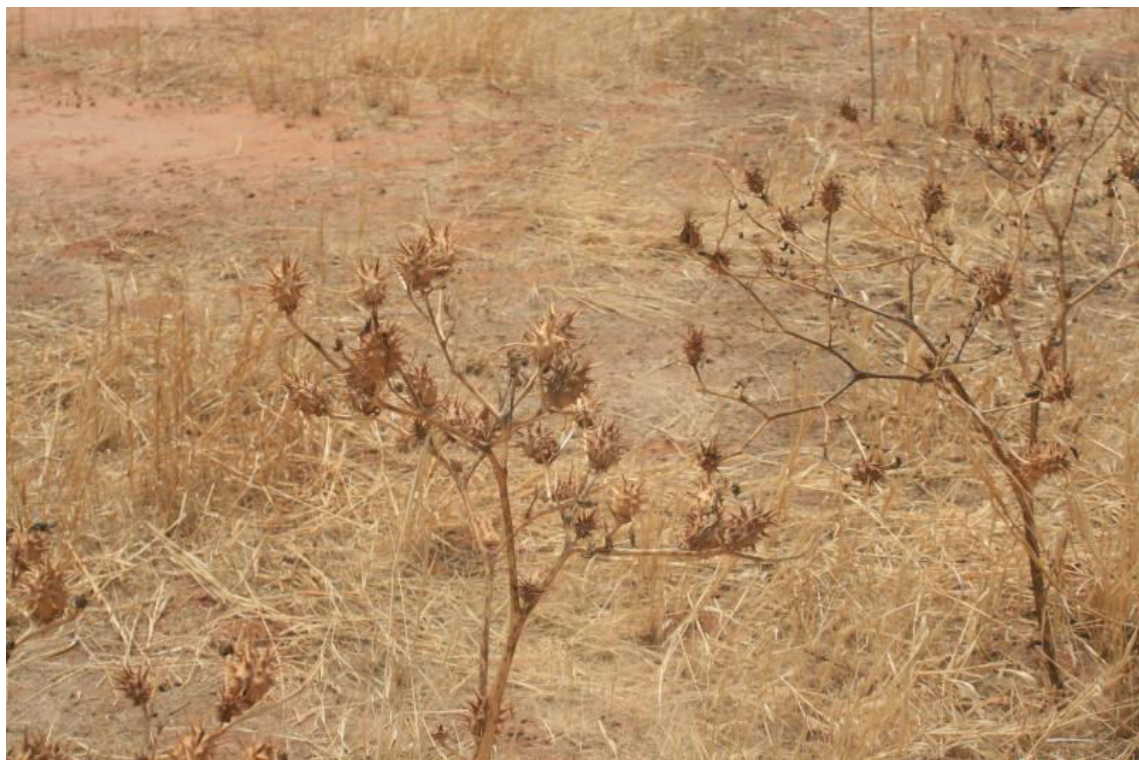
Figure 6. The invasive alien Datura ferox (thorn apple spp.) observed close to water installations and farmsteads.