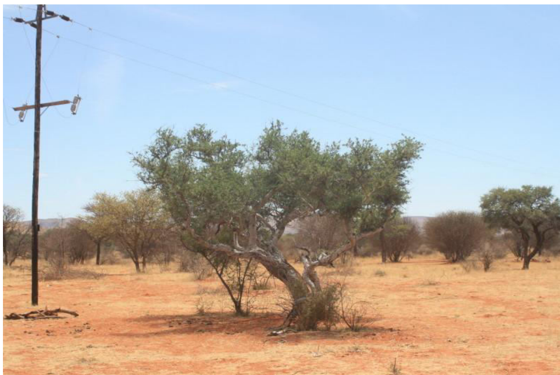
Figure 4. Boscia albitrunca (shepherd's tree) trees are common along this line with this specimen observed in the Isolation Station area.