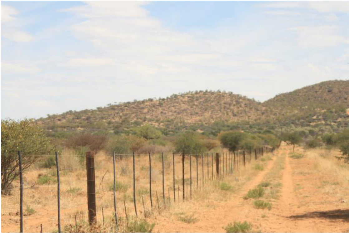
Figure 7. Rocky hill area in the Farm Marula area is viewed as “medium” sensitivity, regarded as high biodiversity areas and thus an important habitat.