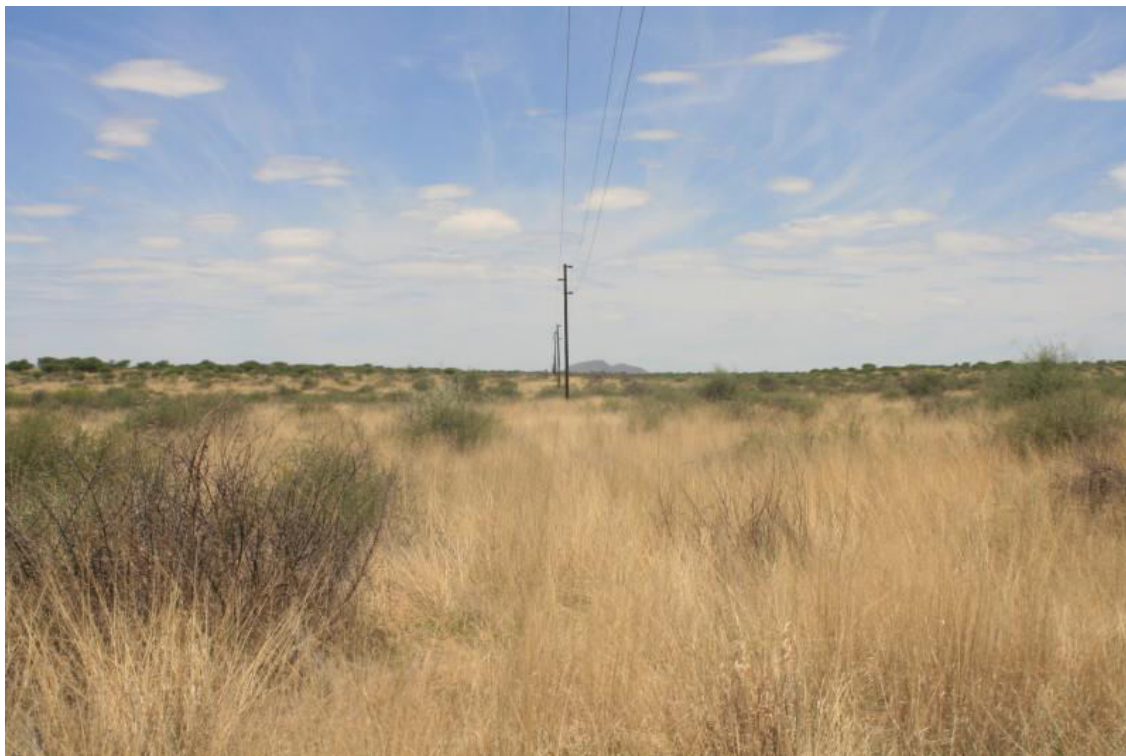
Figure 3. Open grassy area with low shrubs southeast of the Seeis Substation.