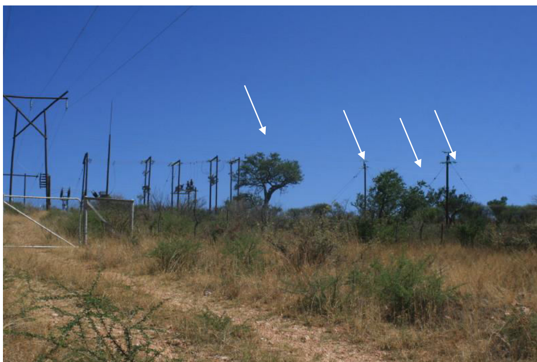
Figure 4. Boscia albitrunca (shepherd's tree) trees are common along this line (See arrows). The Groot Aub Substation is visible in the background.