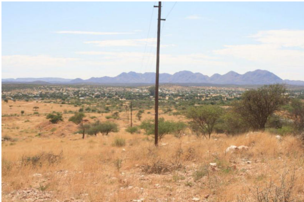
Figure 2. Acacia mellifera (black thorn) is the dominant tree along this mostly sparsely vegetated route. Groot Aub can be viewed in the background.

The route passes through one “hotspot” areas, one viewed as “high” sensitivity, while the rest of the route is viewed as “low” sensitivity, with ephemeral drainage line being the most important habitat, (Cunningham, 2022). Figure 2 – 9 show the sensitive areas and some of the protected plant species found along and in the vicinity of the line servitude.