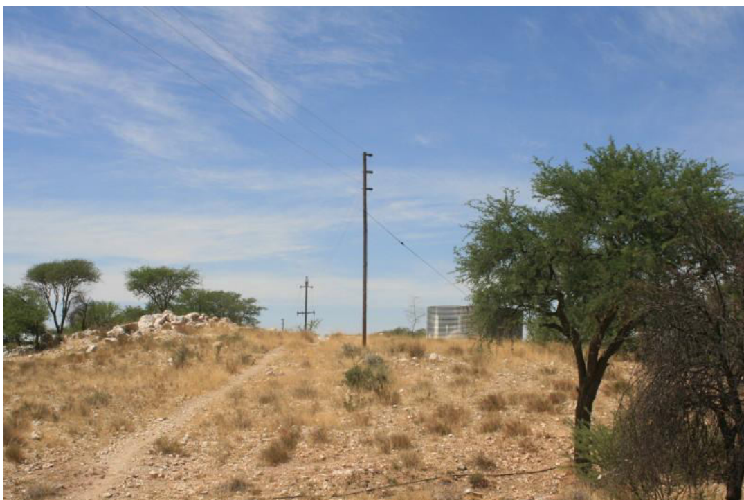
Figure 3. At the end of the backbone on the north-eastern side of Groot Aub.