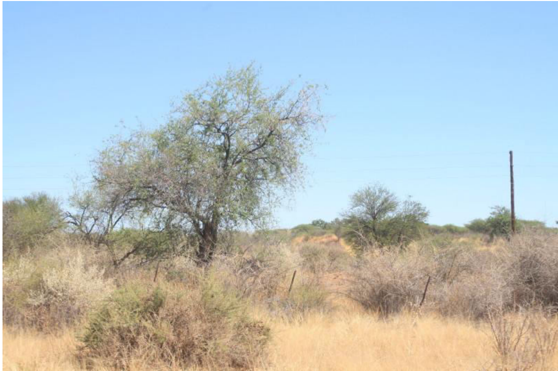
Figure 5. A few large Ziziphus mucronata (buffalo thorn) occur along this route.