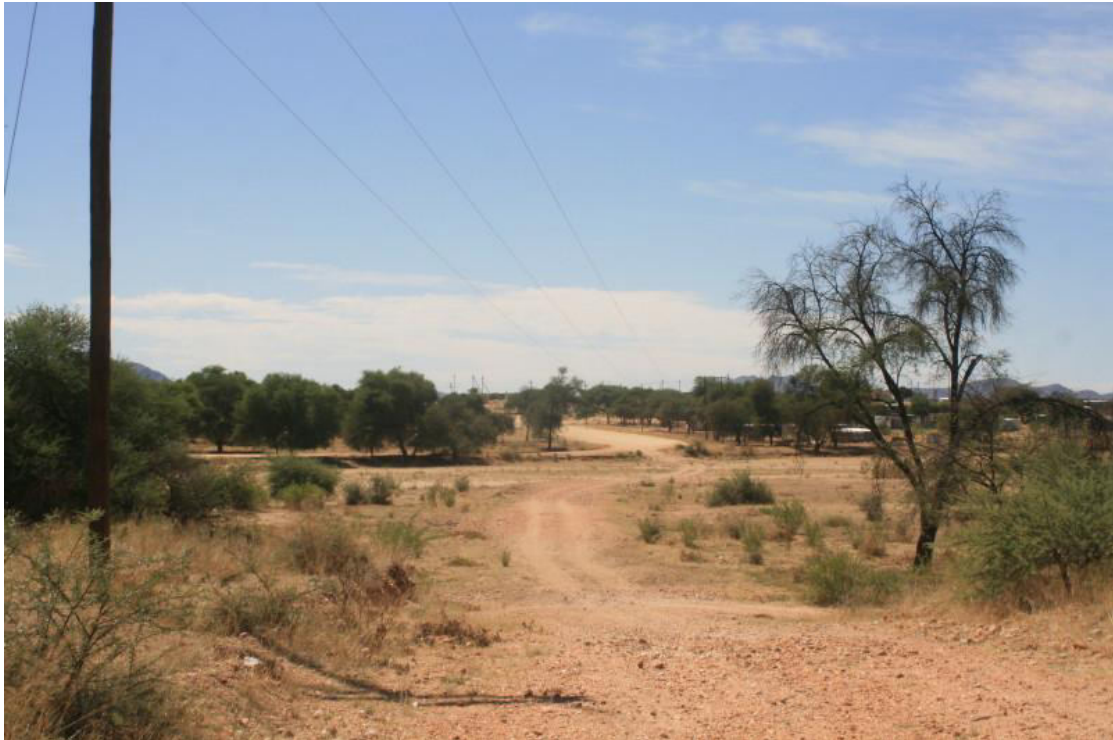
Figure 7. The large ephemeral drainage line at the entrance to Groot Aub is viewed as “high” sensitivity regarded as high biodiversity areas and thus an important habitat.