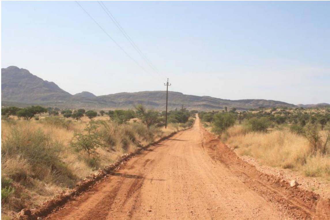
Figure 3. The line follows the Farm Boaudei gravel access route where the backbone ends.