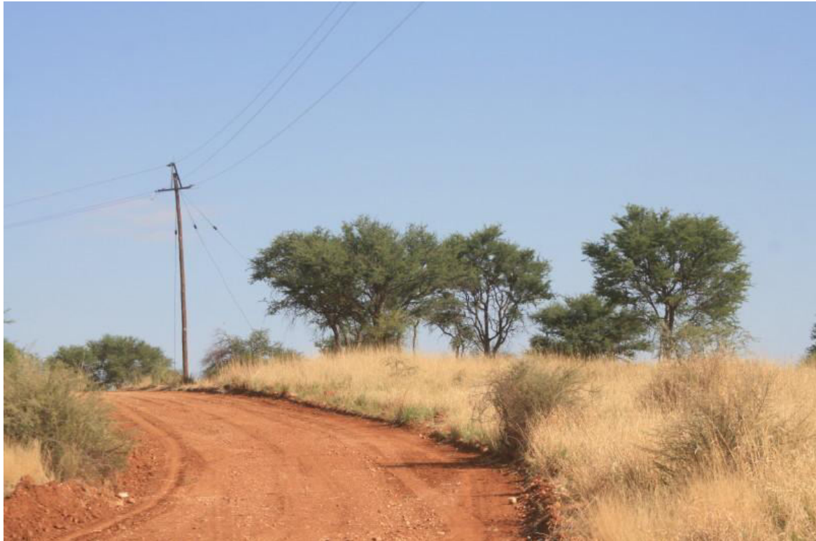
Figure 5. Large Vachellia erioloba (camel thorn) trees occur along this route.