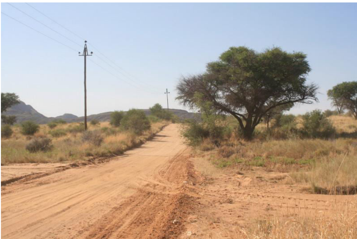
Figure 6. An ephemeral drainage line close to the Farm Bouadei is viewed as “high” sensitivity with potentially high biodiversity and thus an important habitat.