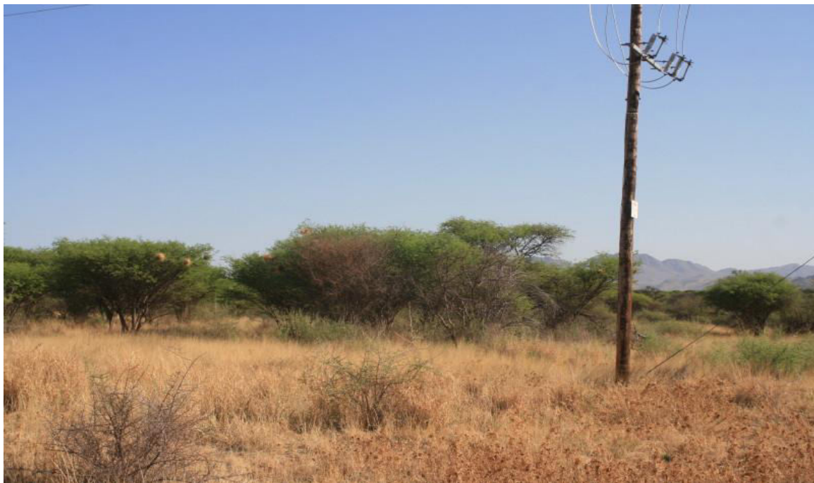
Figure 2. Vachellia mellifera (black thorn) is the dominant tree along this mostly sparsely vegetated route.

The route passes through one “hotspot” area, viewed as “high” sensitivity. Along the Aris – Aris electrical reticulation system section, 1.5% of the route is viewed as “high” sensitivity, with the ephemeral drainage line viewed as “high” sensitivity area with high biodiversity and thus an important habitat. 98.5% of the route is viewed as “low” sensitivity, with no unique habitats, (Cunningham, 2021). Figure 2 – 9 show the sensitive areas and some of the protected plant species found along and in the vicinity of the line servitude.