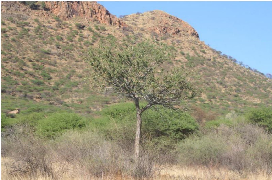
Figure 4. Boscia albitrunca (shepherd's tree) trees are common along this line around the Aris Substation area.