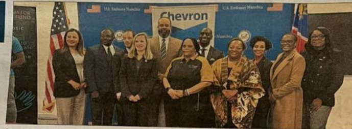
Representatives from the Office of the President, Chevron and Palms for Life at the recent signing ceremony to help address food shortages.

tritious meals for 3 150 highly vulnerable people, including children under five, pregnant and breastfeeding women, and marginalised groups. With shared household consumption, the programme is projected to benefit 15 750 people each year.