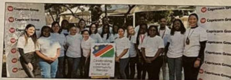
Over 40 community heroes gathered to share stories, games and laughter, a recognition at the Heroes' Day celebration.

ers honoured their remarkable achievements in community service, as they strive to change lives and create a positive impact by supporting at-risk youth, children, the elderly, abandoned animals and more.