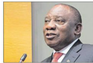
ANC President Cyril Ramaphosa.

pipes and wastewater treatment plants, and the accompanying smell, are a reminder that 27-year-old promises of a better life for all after white minority rule ended remain unfulfilled for many.