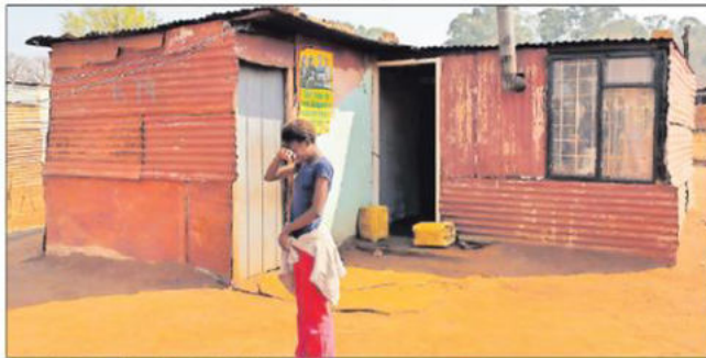
Unemployment and inequality is rising in South Africa.