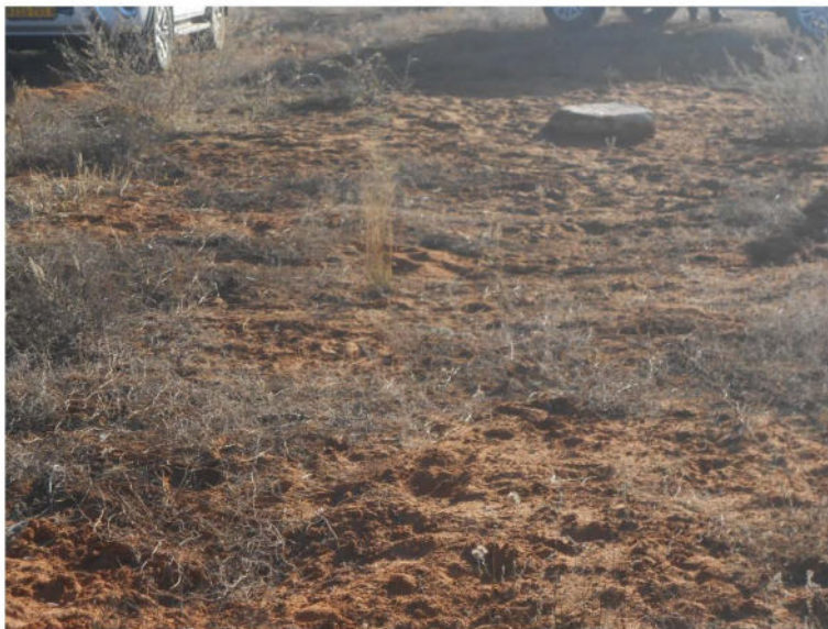
Site image: shows clearing around the exploration well