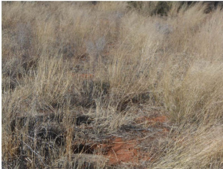
Site image: shows vegetation around the area of study