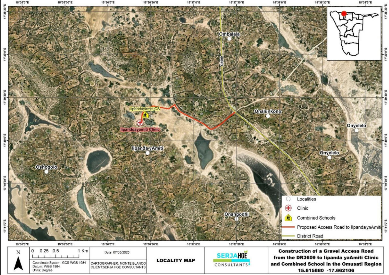
Locality map of the proposed access gravel road from DR3609 to lipanda YaAmiti Clinic and School in the Omusati Region (GPS Centre coordinates: -17.662106 15.615880)