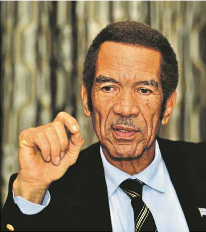
Botswana's former President Ian Khama

Angola is under fire after it denied entry to several senior African political figures set to attend a conference hosted by the country's main opposition party. Unita said it had invited the politicians, including Tanzanian opposition leader Tundu Lissu, Mozambique's Venancio Mondlane and Botswana's former President Ian Khama, to a summit on democracy. "The action of the Angolan government to prevent us from entering Angola is inexplicable and unacceptable," Lissu said on X. The BBC has asked the Angolan government to comment. But according to a source from the Migration and Aliens Service (SME), "the expulsion was due to irregularities in the visa procedure, which prevented Mondlane and 13 other members of his entourage from entering Angolan territory". Mondlane, who has called for nationwide protests over what he says were rigged elections last year, was this week subjected to travel restrictions in his home country. At least 20 leaders and representatives from various political parties across Africa were denied entry, said Lissu. "The government of this country is ruling a dictatorship while pretending that Angola is a democratic country," he said. Lissu is a vocal critic of the