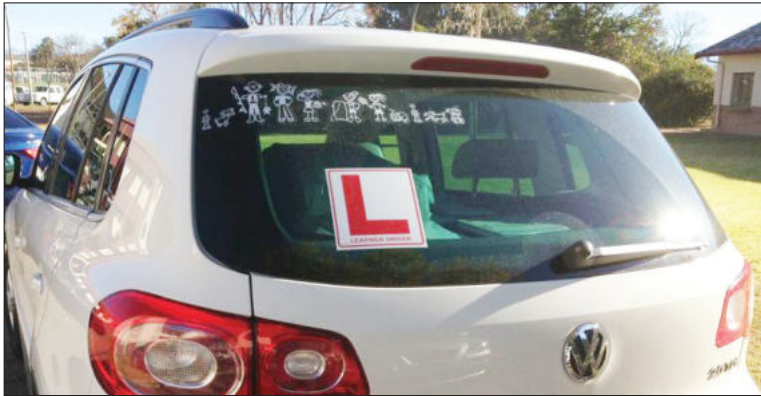
Great responsibility... A learner driver must always be accompanied by a fully licensed driver in the vehicle while operating it.

According to the Road Traffic and Transport Act, 1999 (Act No. 22 of 1999) and the Road Traffic and Transport Regulations, no person is