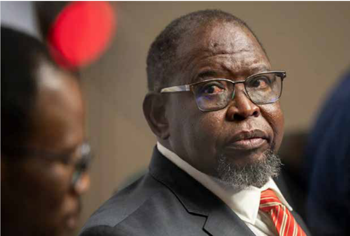
Finance Minister Enoch Godongwana faces criticism over statements on the sustainability of the Social Relief of Distress (SRD) grant.