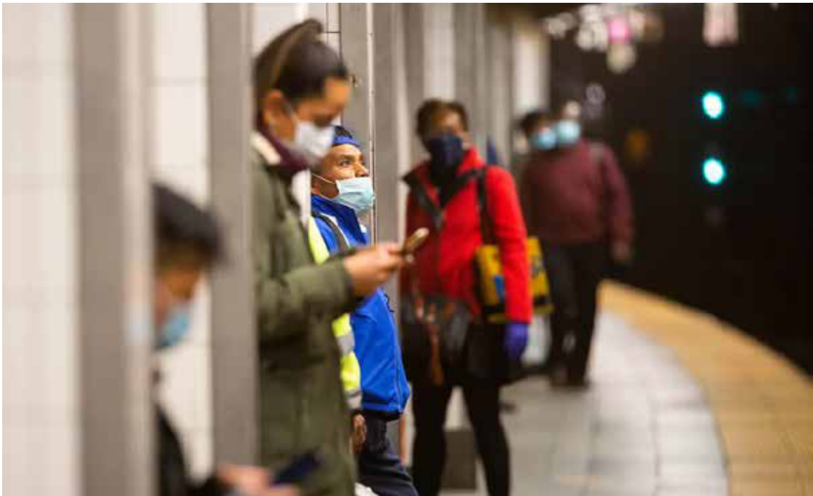
People wearing protective masks wait on a subway platform at Grand Central in New York, U.S., on Monday, Sept. 21, 2020.

'It's like everyone is moving on without us' In February 2020 I was living a vibrant, full life. I hiked, backpacked and rock climbed. I had a strong community. I was planning to go to med school. Lockdown