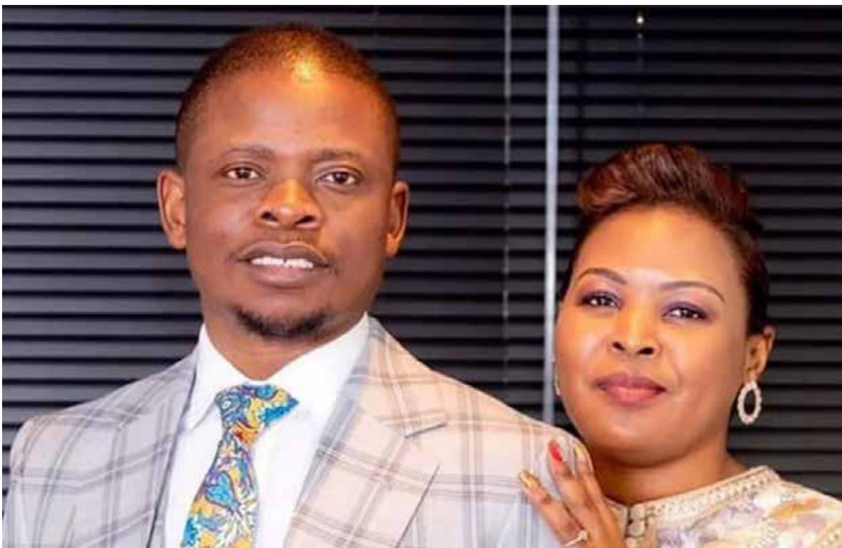
Prophet Shepherd Bushiri and his Mary have ordered to be extradited to South Africa to face charges, including rape among others.