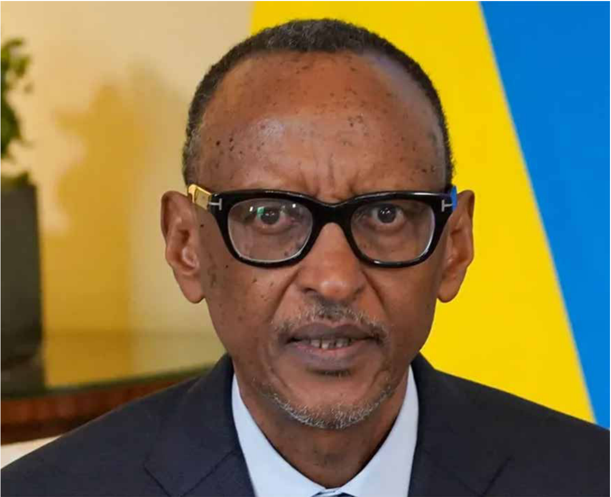
President Paul Kagame

Belgium will be declared “persona non grata”. This declaration can lead to the removal of diplomatic status and often results in the expulsion or the withdrawal of recognition of envoys. Before Kigali cut ties with Brussels, Rwandan President Paul Kagame vowed that his country would “stand up” to Belgium. “We would ask [Belgium]: ‘Who are you by the way? Who put you in charge of us?’ Rwandans believe in God, but did God really put these people in charge of Rwanda?” Kagame asked in an address on Sunday. Since the beginning of the year, around 7,000 people have been killed in fighting between the M23 and DR Congo’s armed forces in the east of the country, the Congolese authorities have said. More than 850,000 people have been forced to flee their homes since the conflict increased in intensity in January, the UN children’s agency, Unicef, said. The M23 has taken control of two key cities - Goma and Bukavu - in the past two months. On Monday, the EU sanctioned three of Rwanda’s military commanders, citing connections to the M23. The sanctions, which include the freezing of assets, were also applied to the head of Rwanda’s state mining agency. The EU has accused the agency of exploiting DR Congo’s conflict in order to extract valuable resources from the mineral-rich east. Britain and Germany have also taken measures against Rwanda - over the past month both countries cut some of their aid to Kigali.