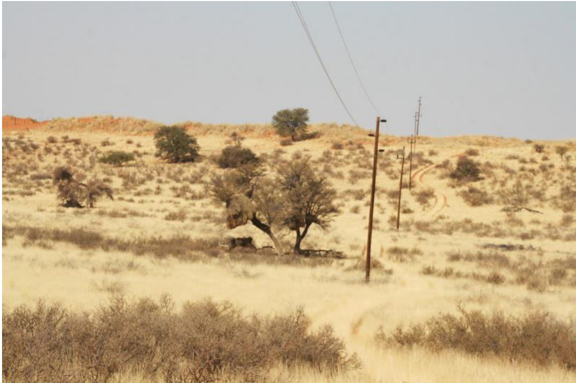
Figure 4. Vachellia erioloba (camel thorn) are the largest tree species encountered along the route.