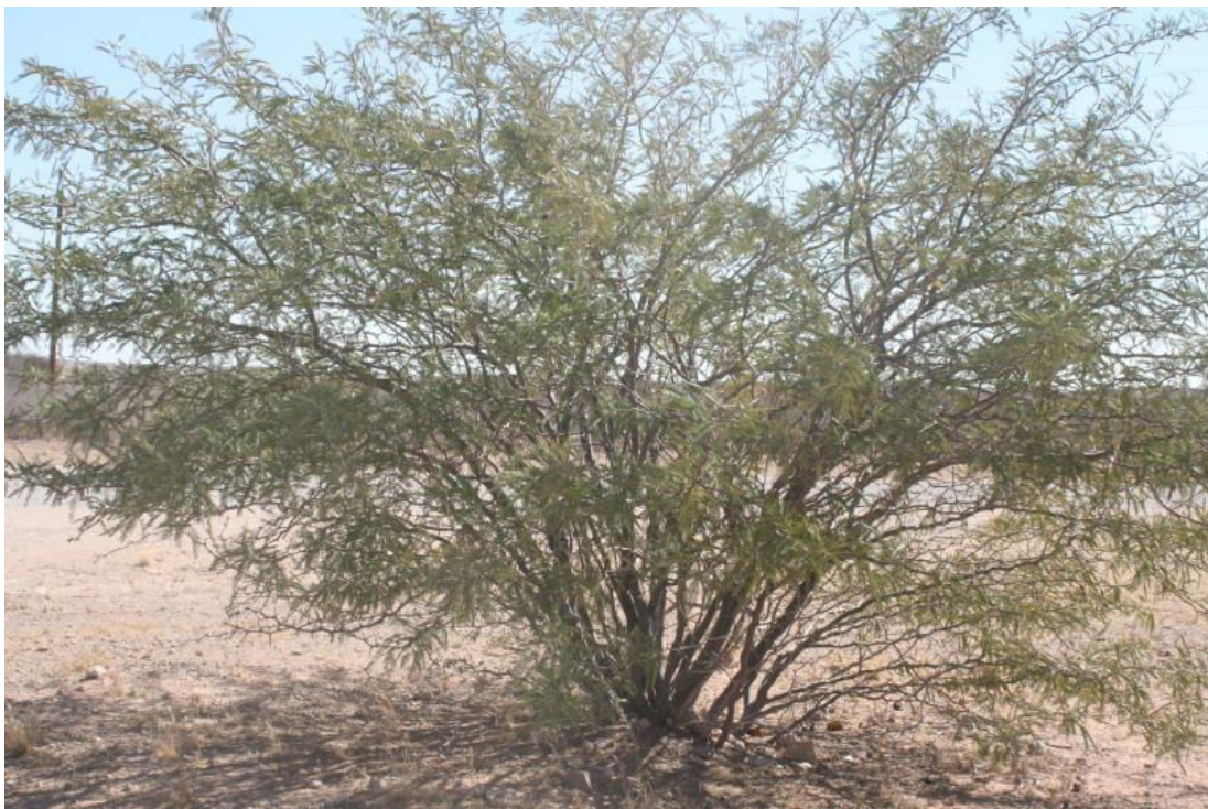
Figure 9. The invasive alien Prosopis spp. was observed as individuals close to Aroab.