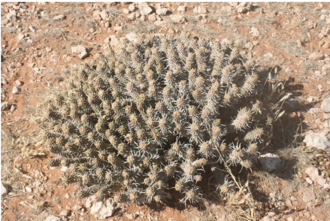
Figure 7. Hoodia juttae – endemic, protected, observed on calcrete soil as two individual specimens only. Damage to this endemic protected species must be avoided.