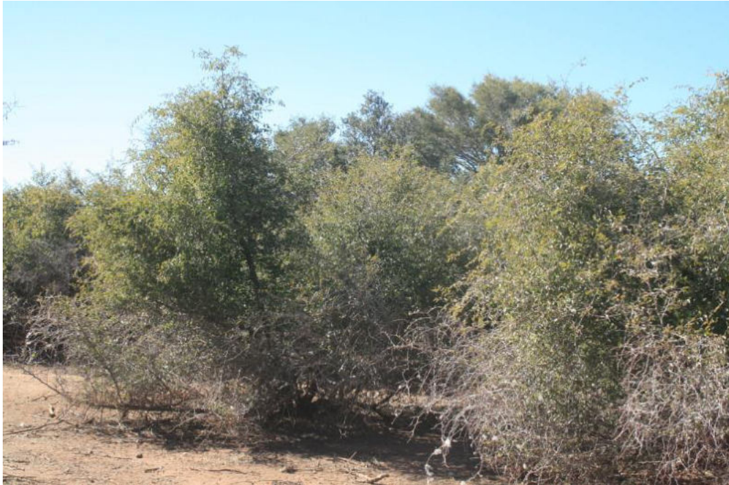
Figure 8. Ziziphus mucronata (buffalo thorn) observed in areas where water collects.