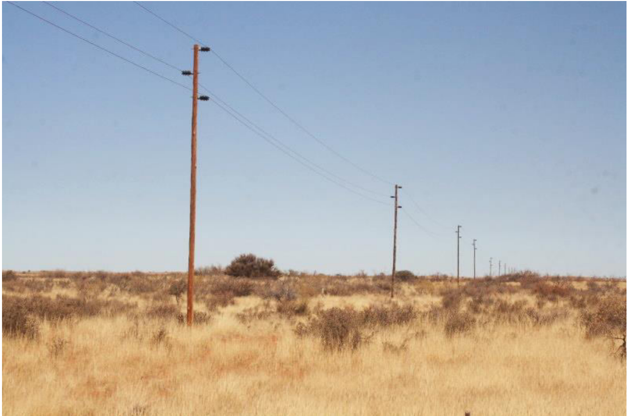
Figure 2. Rhigozum trichotomum (three thorn) shrubs are dominant in the dune streets along this route.