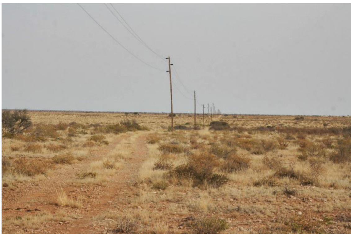
Figure 3. The harder calcrete soils are dominated by dwarf shrubs such as Barleria rigida and Monechma genistifolium .