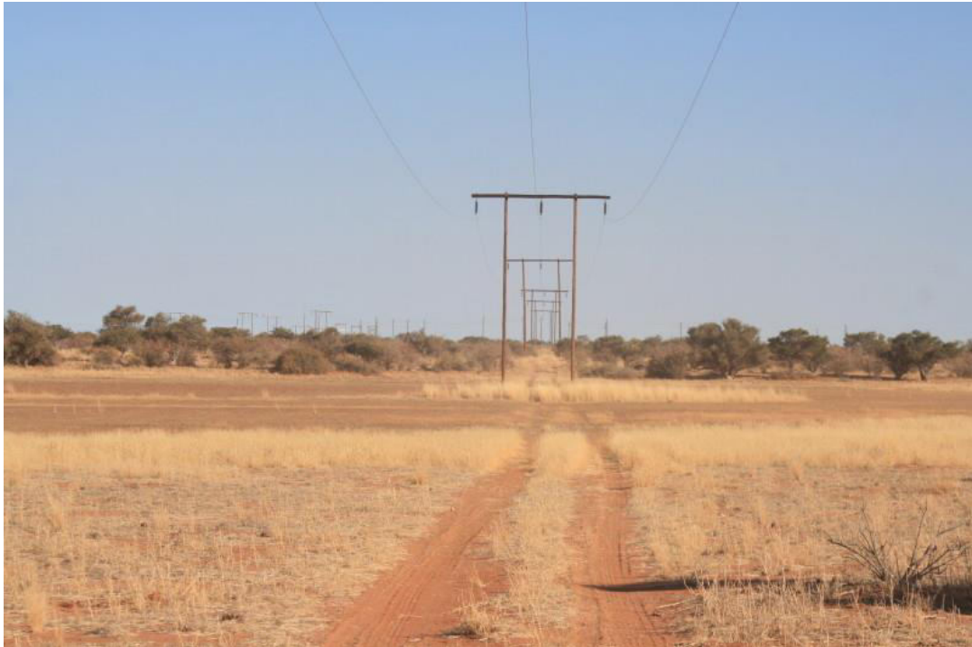
Figure 10. Pans, especially with dense vegetation on the periphery are viewed as “high” sensitive habitat.