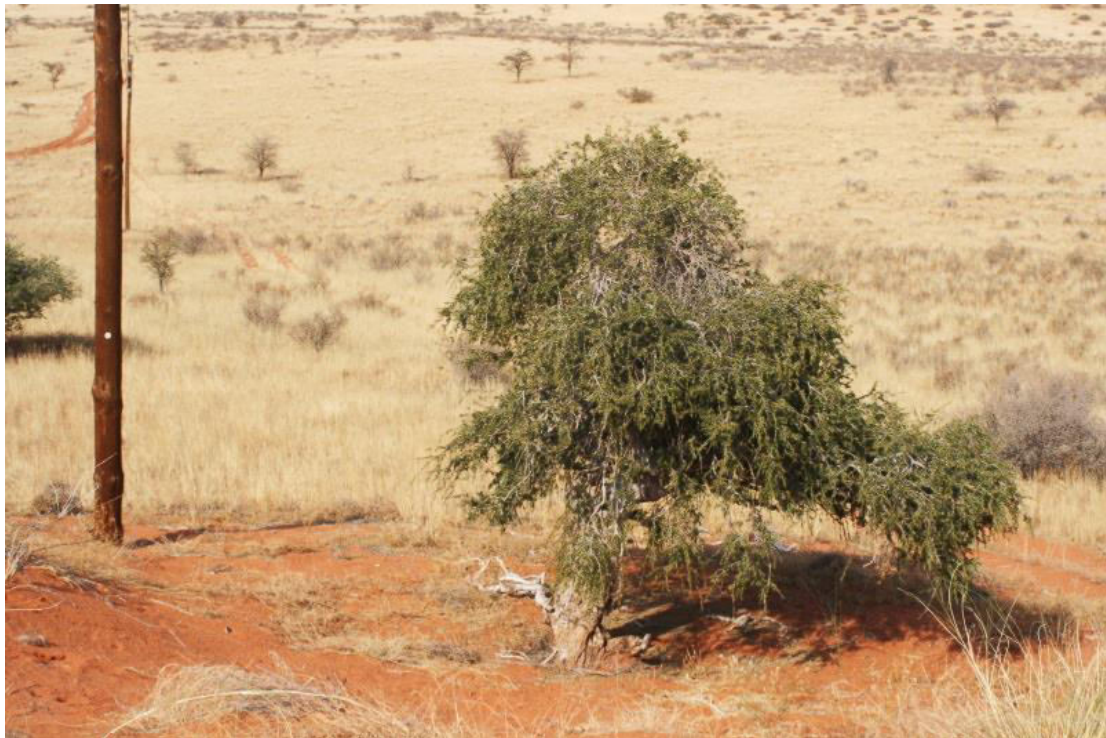
Figure 5. Boscia albitrunca (shepherd's tree) are encountered as large scattered individual specimens along the route.