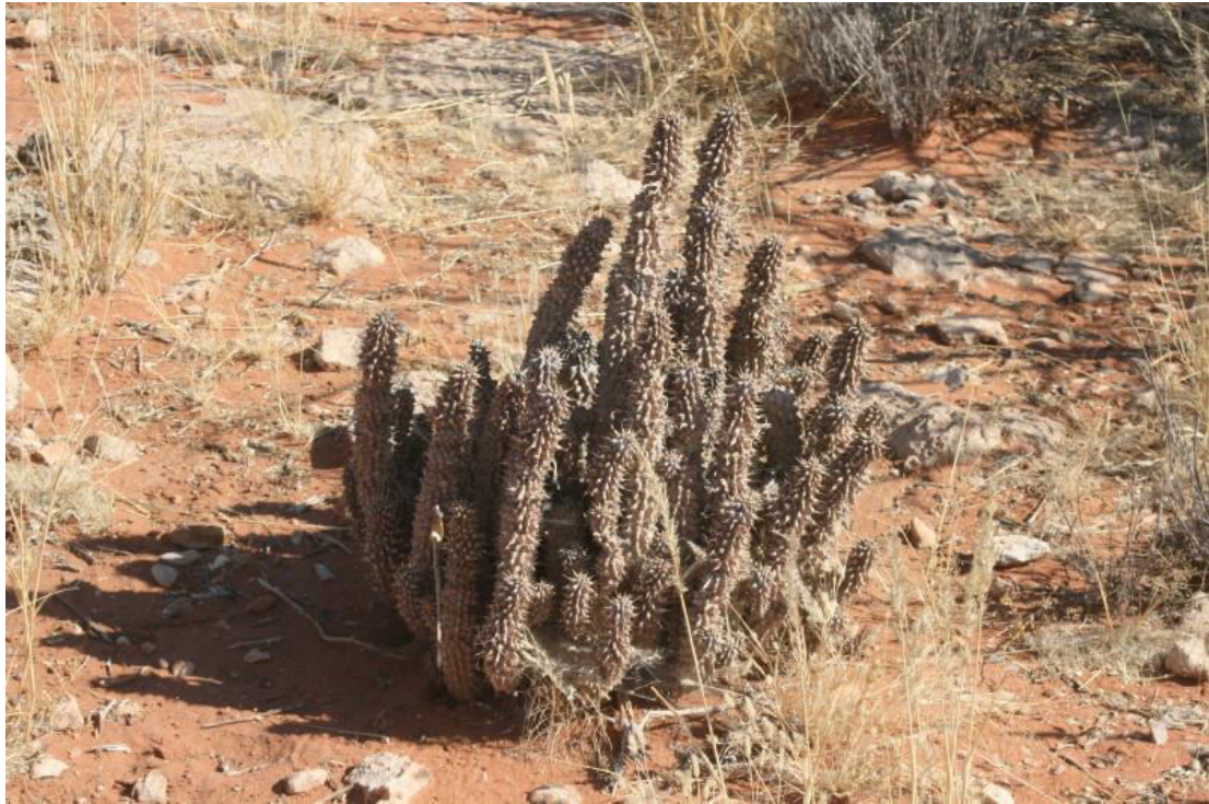
Figure 6. Hoodia gordonii observed as individual plants only. Damage to this endemic protected species must be avoided.