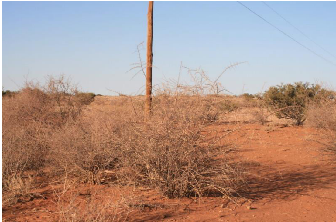
Figure 3. Catophractes alexandri (trumpet thorn) often formed dense stands in association with Vachellia nebrownii (water thorn) and Rhigozum trichotomum (three thorn) along the route.