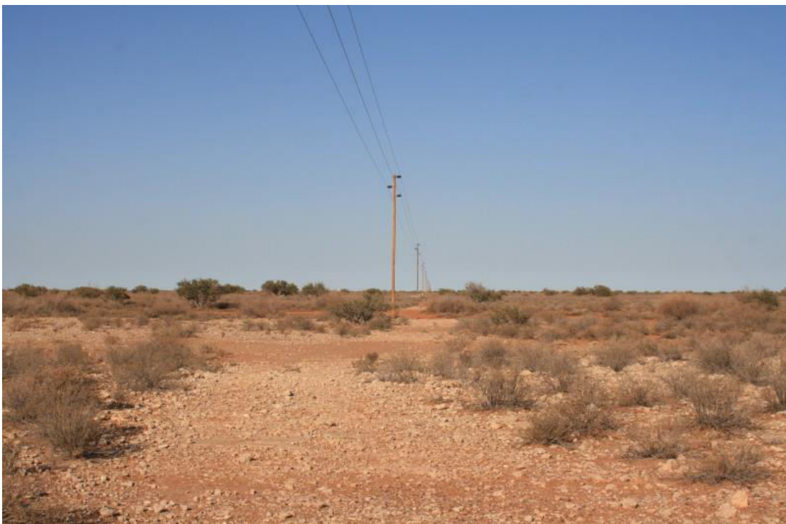
Figure 4. Rhigozum trichotomum (three thorn) is a low shrub mainly associated with calcrete soils in the area.