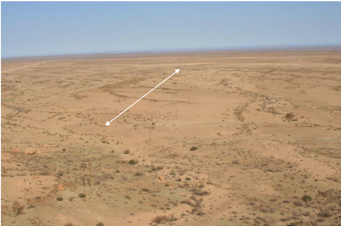
Figure 8. The sparsely vegetated plain associated with the Mariental – Gibeon reticulation system (See arrow) as viewed from the escarpment west towards Gibeon.