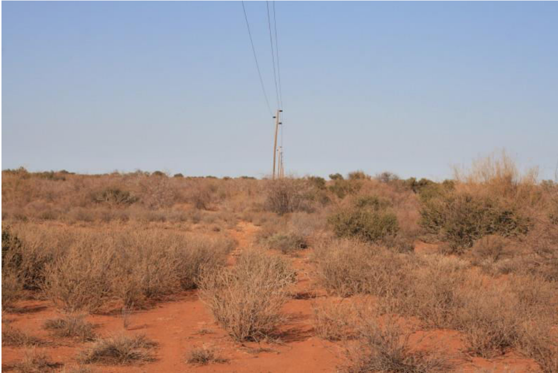
Figure 9. Dense patches of Vachellia nebrownii , Catophractes alexandri , Lycium bosciifolium , Phaeoptilum spinosum , Rhigozum trichotomum are viewed as “problem” areas along certain sections of the route.