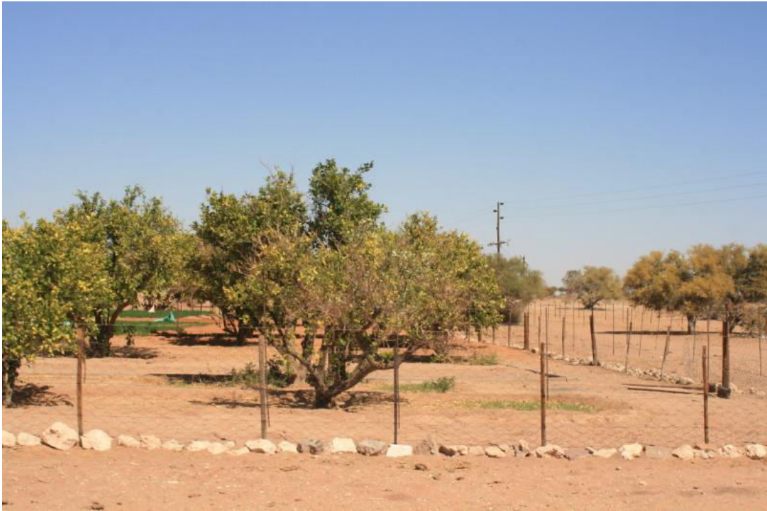
Figure 7. Farm homesteads with crops, orchard and small scale irrigation are viewed as important areas (“medium”).