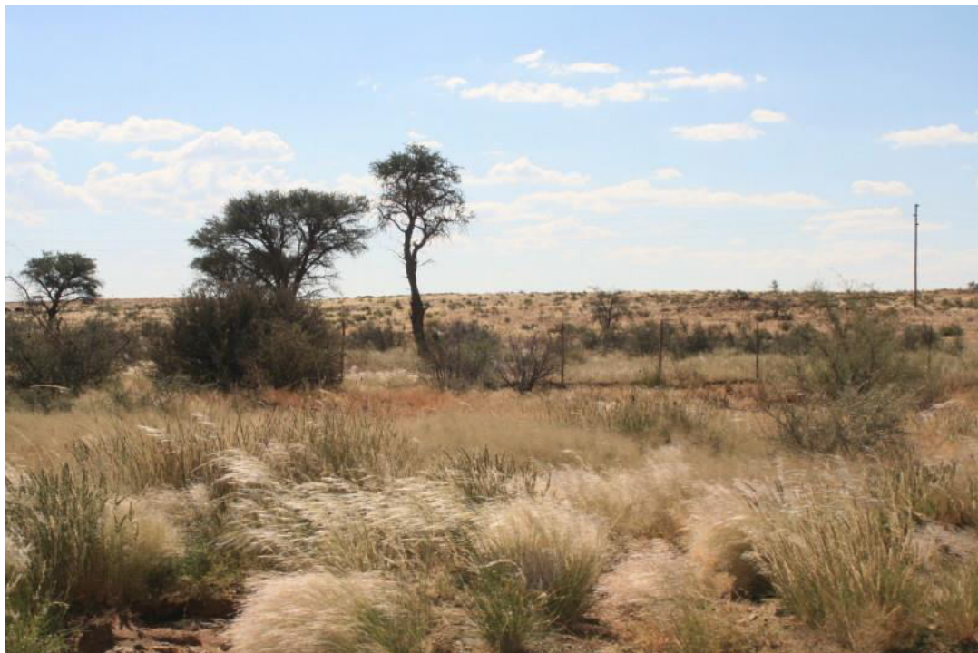
Figure 3. A patch of Vachellia erioloba (camel thorn) associated with a small ephemeral drainage line.