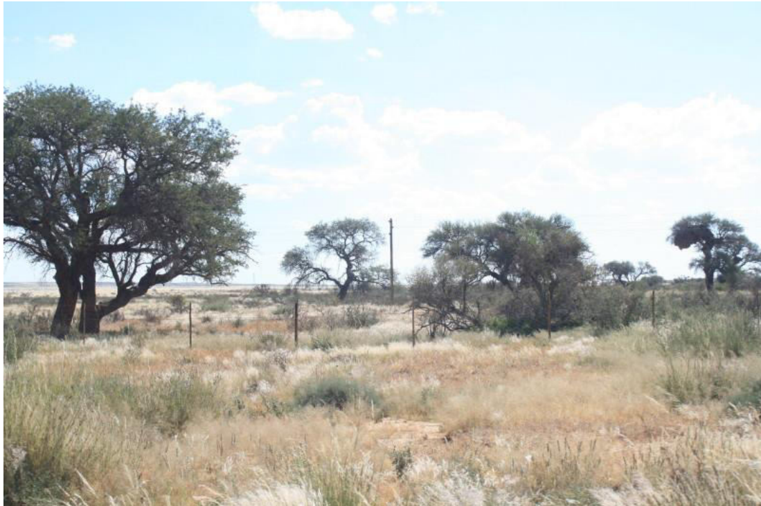
Figure 6. A patch of large Vachellia erioloba (camel thorn) observed along an ephemeral drainage line is viewed as the most important species (and habitat) along this route.