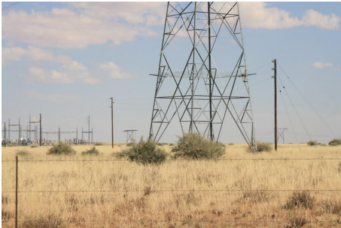
Figure 5. The Harib Substation can be viewed in the background.