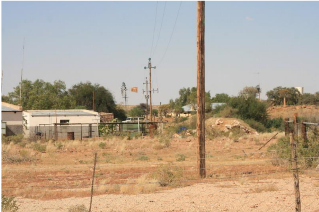
Figure 4. The Harib-Schonau line ends at the Farm Schonau farmstead.