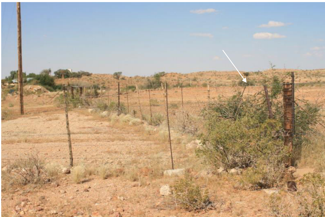
Figure 7. The invasive alien Prosopis spp. (mesquite spp.) was observed close to the Schonau farmstead (See arrow).