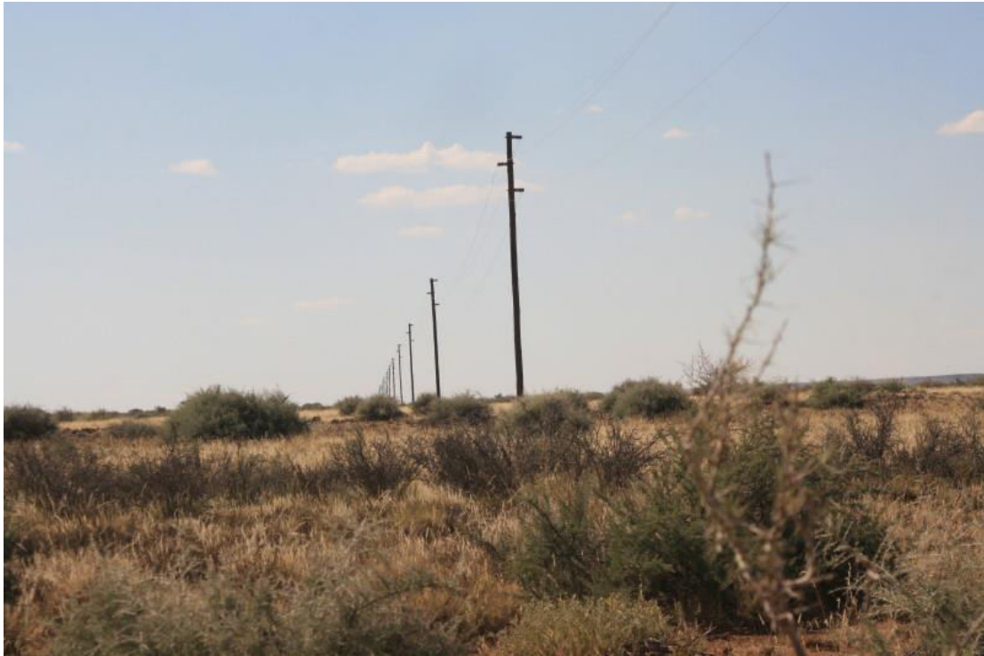
Figure 2. Phaeoptilum spinosum shrubs and Stipagrostis spp. grasses are the dominant species along this route.