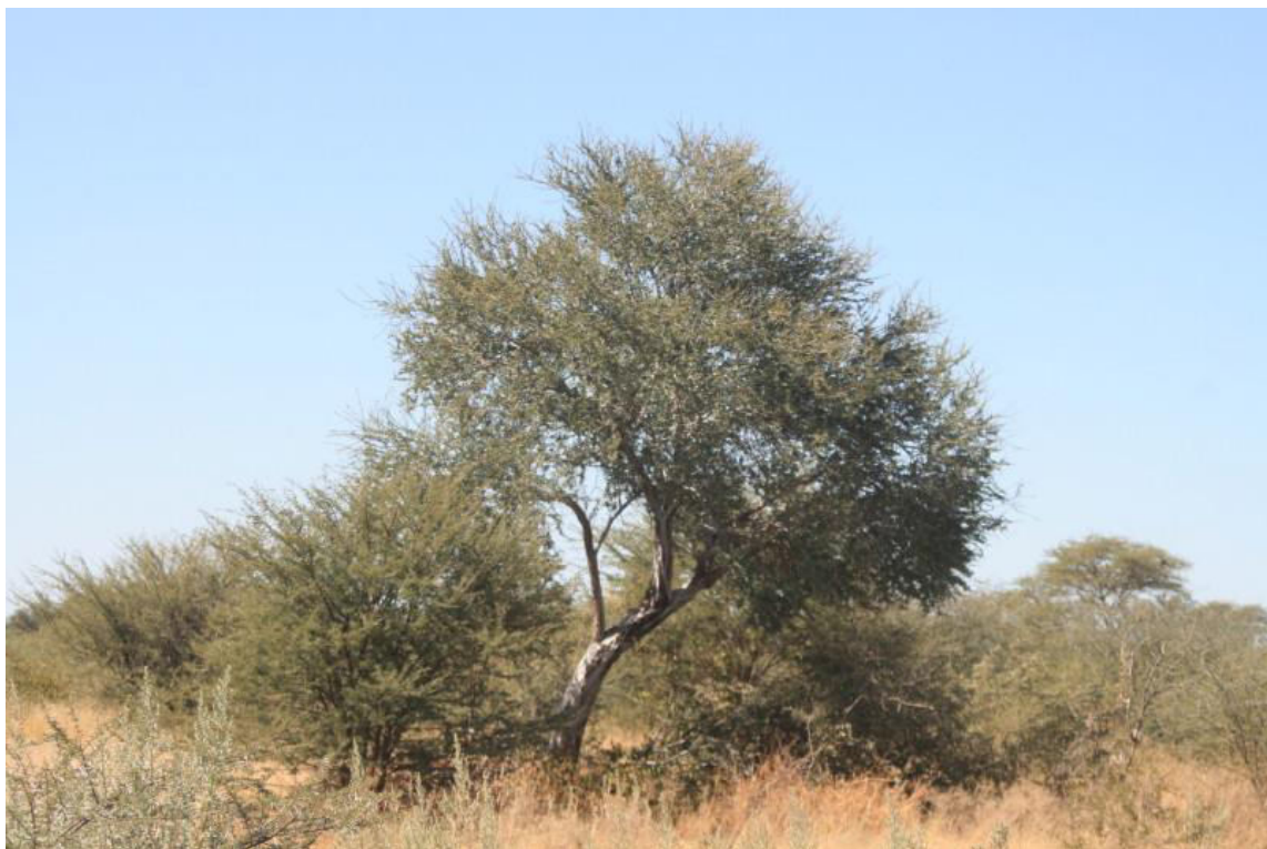
Figure 3. Large Boscia albitrunca (shepherd's tree, protected) individuals observed along the line.