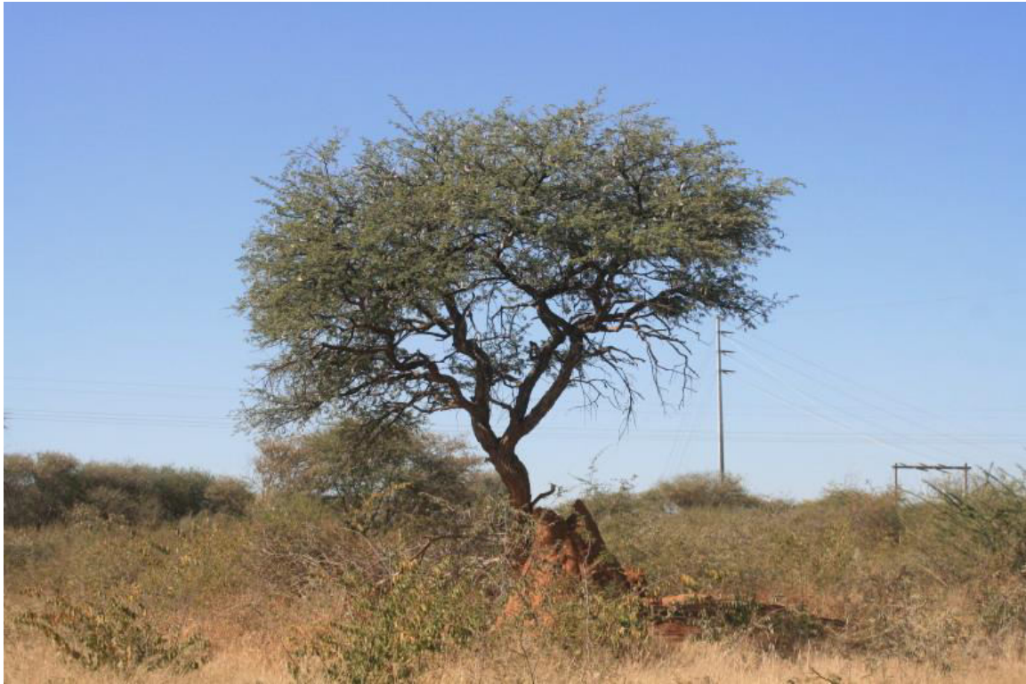
Figure 2. Vachellia erioloba (camel thorn, protected) occurring along the line.