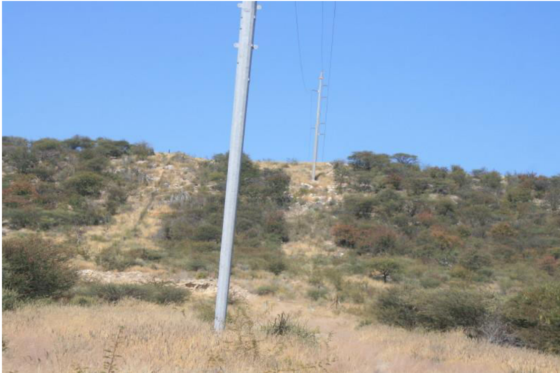
Figure 4. The limestone ridge is viewed as “high” sensitivity with potentially high biodiversity and thus important habitat.