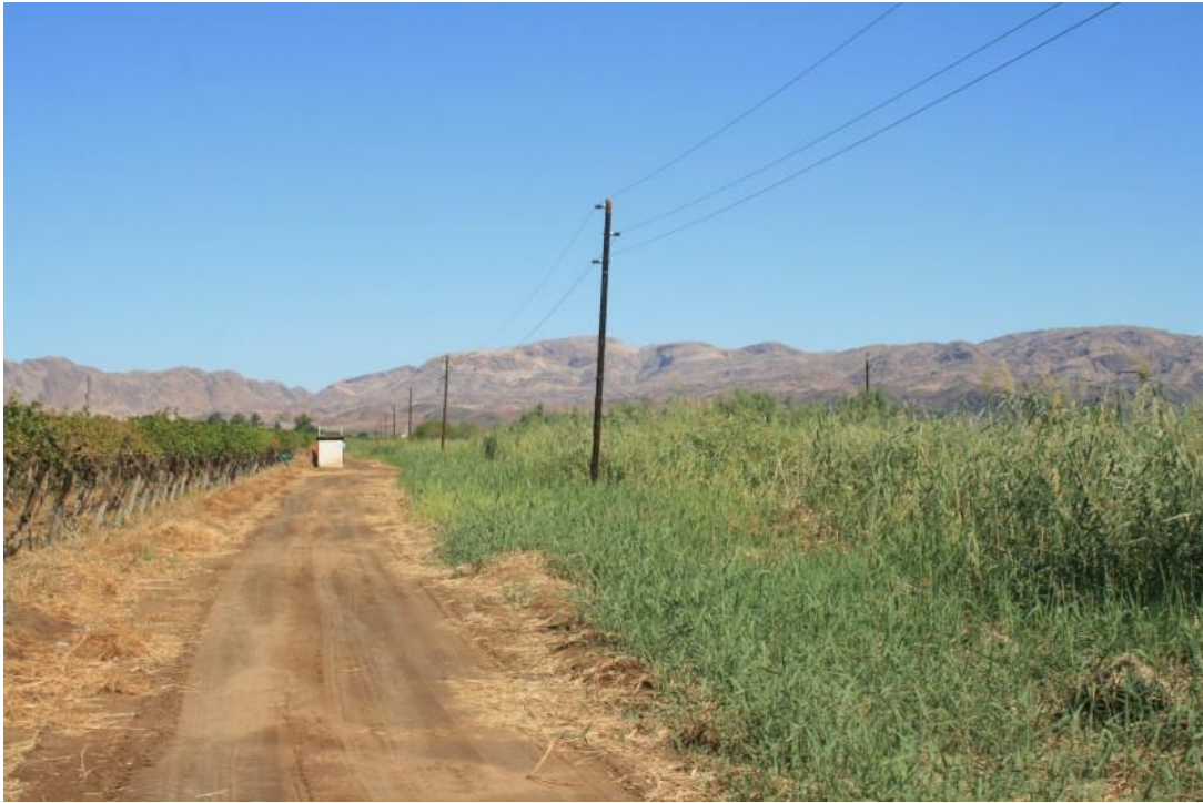
Figure 6. Phragmites australis (reeds) occur along various portions of the Aussenkehr - Aussenkehr 22kV North line route, especially along water rich areas.