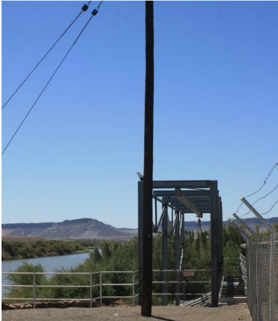
Figure 10. The 22kV Aussenkehr-Aussenkehr South route services pump stations along the Orange River.