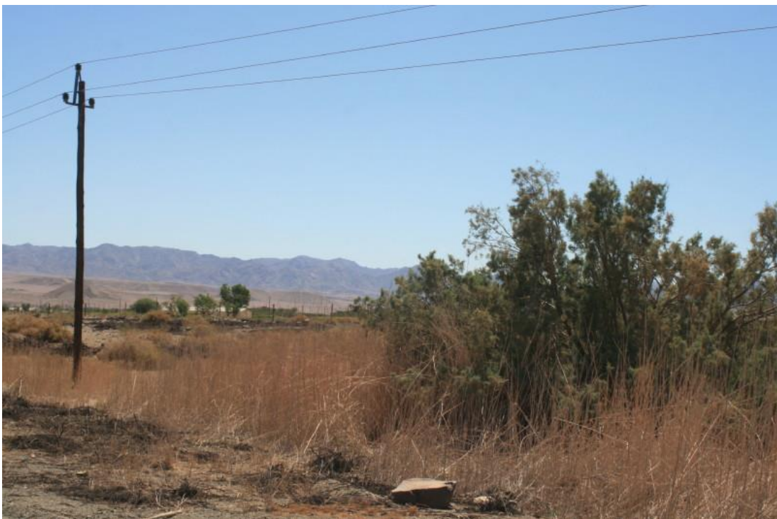
Figure 7. Tamarix usneoides (wild tamarisk) observed at a few patches along the route.