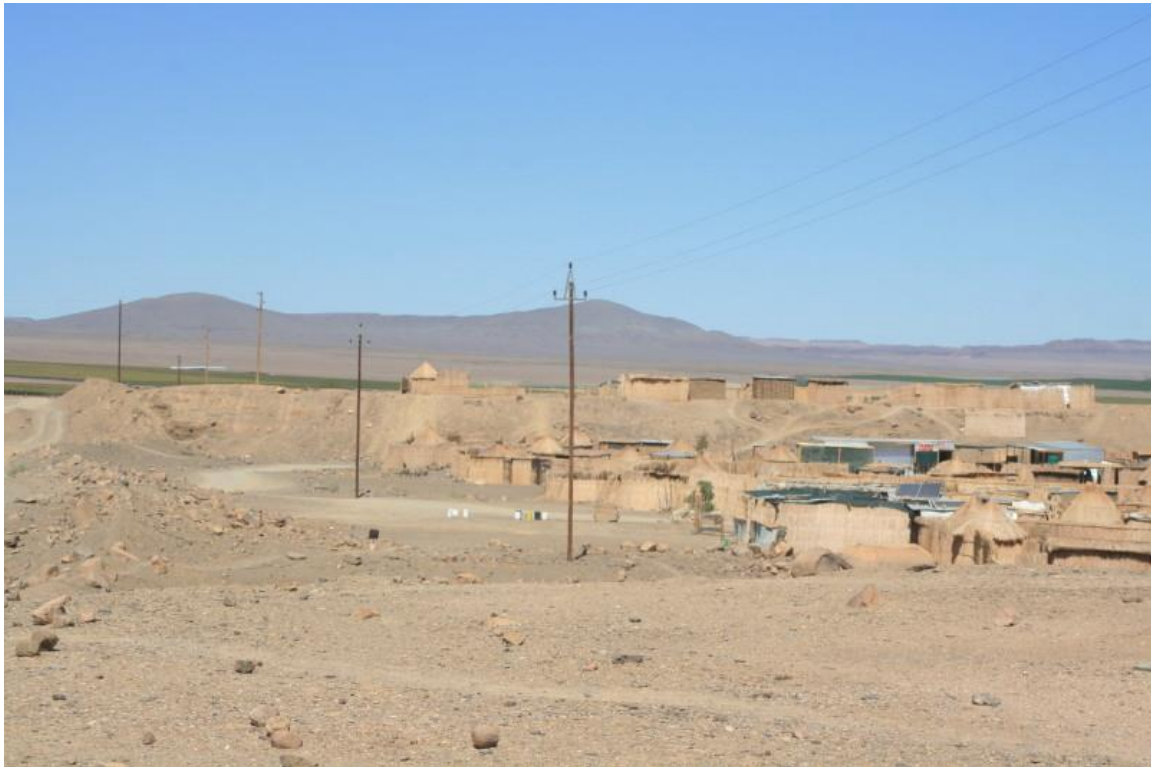
Figure 2. The 22kV Aussenkehr - Aussenkehr North route runs through informal settlements outside Aussenkehr.

as the most important feature, (Cunningham, 2021). Figure 2 – 10 show the sensitive areas and some of the protected plant species found along and in the vicinity of the line servitude.