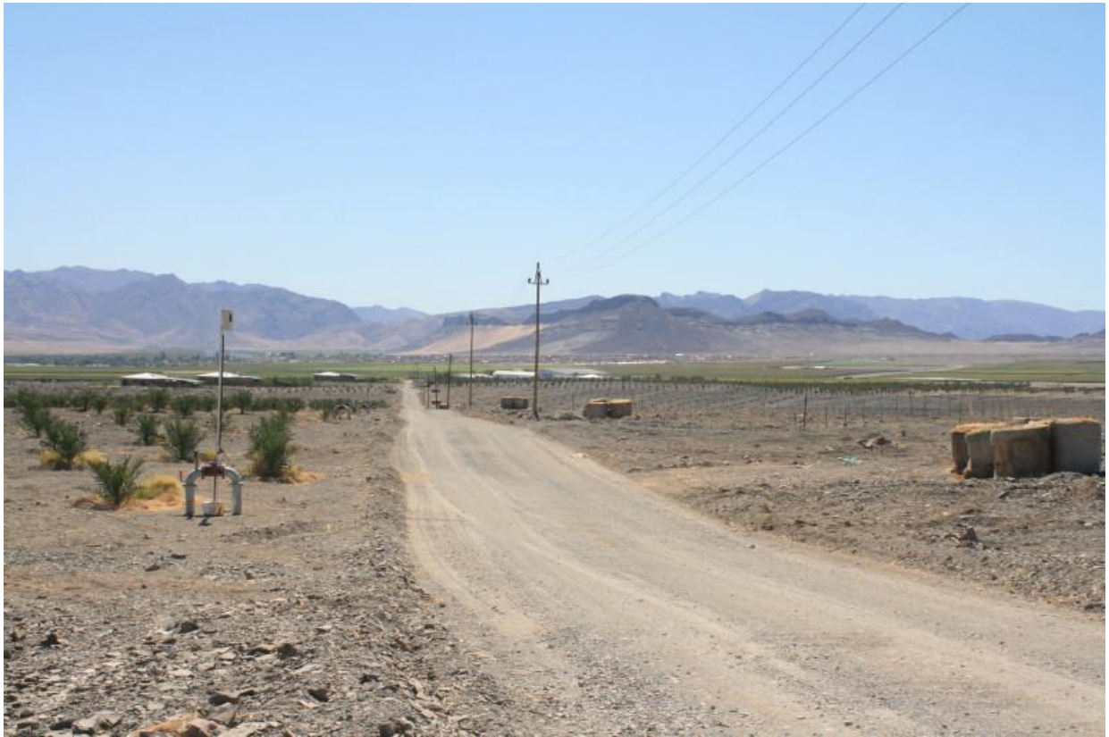
Figure 4. The 22kV Aussenkehr - Aussenkehr North route runs through date plantations, etc.