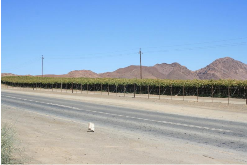
Figure 8. The 22kV Aussenkehr-Aussenkehr South route runs through vineyards and other disturbed areas.