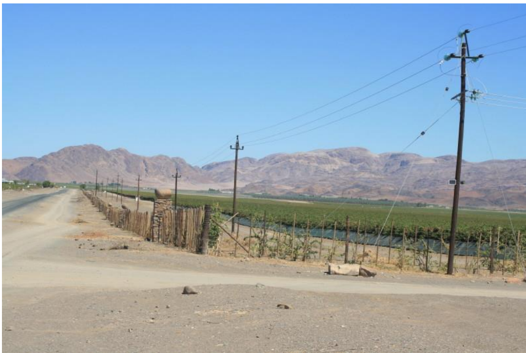
Figure 5. The 22kV Aussenkehr - Aussenkehr North route runs through vineyards, etc.