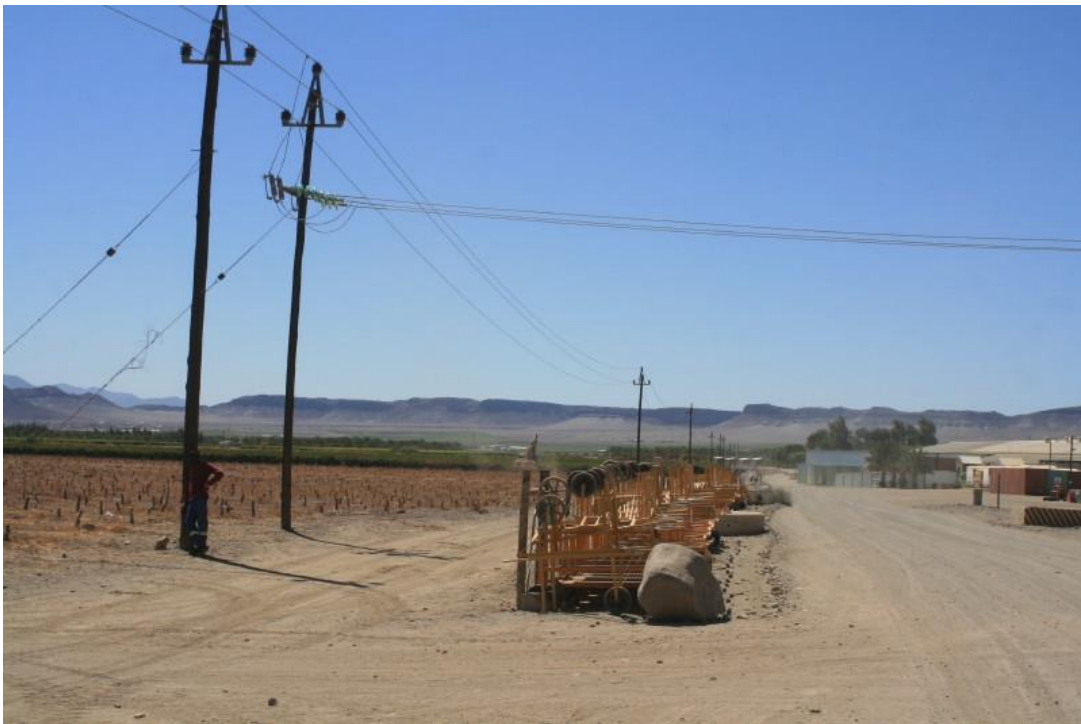
Figure 9. The 22kV Aussenkehr-Aussenkehr South route services various farms and associated farming infrastructures.