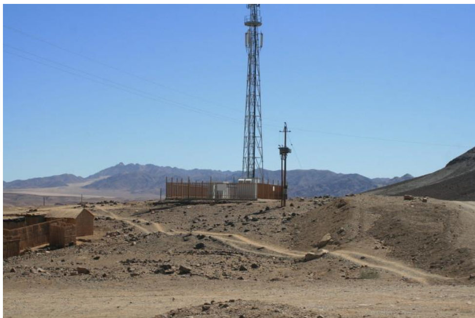
Figure 3. The 22kV Aussenkehr - Aussenkehr North route services the MTC tower outside Aussenkehr.