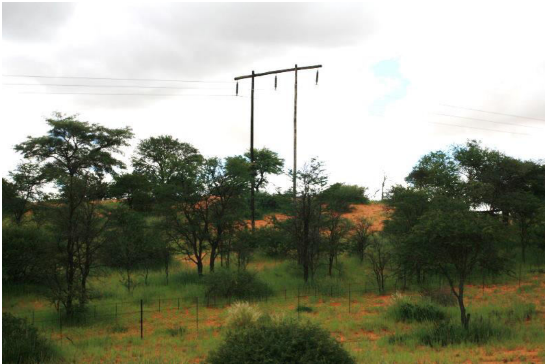
Figure 2. Dense stands of Vachellia erioloba (camel thorn) occur under some sections of the line, especially on dune areas closer to Aranos.

The route passes through 3 “hotspot” area classified as “high” sensitivity. Along the Aranos - Stampriet section 1.3% of the route is viewed as “high” sensitivity and 98.7% viewed as “low” sensitivity with the pans and Auob River areas being the most important features, (Cunningham, 2021). Figure 2 – 12 show the sensitive areas and some of the protected plant species found along and in the vicinity of the line servitude.