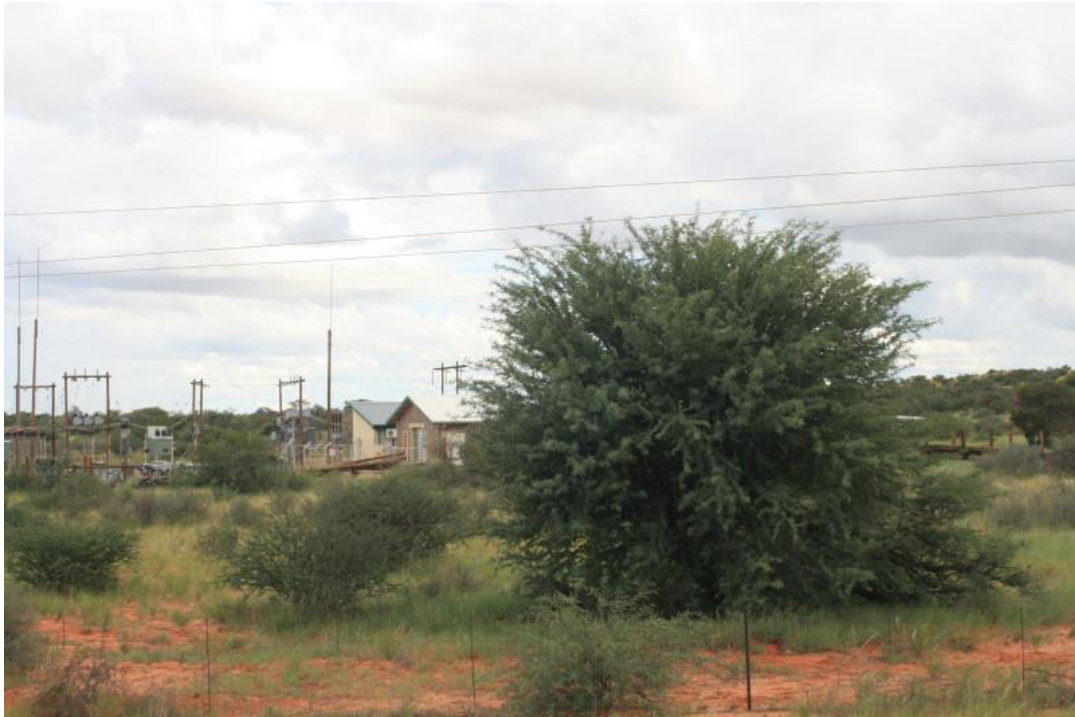
Figure 7. Prosopis spp. (mesquite) individuals under line close to the Aranós Substation area.