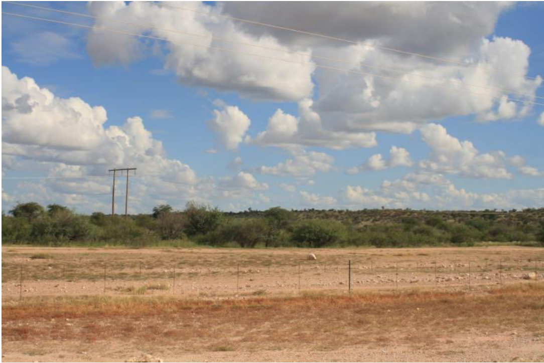
Figure 9: Pan areas are viewed as a sensitive habitat (“high”).