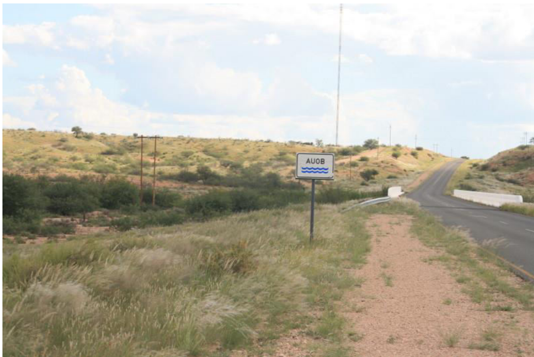
Figure 8. Prosopis spp. (mesquite) is dominant along/within the Auob River.