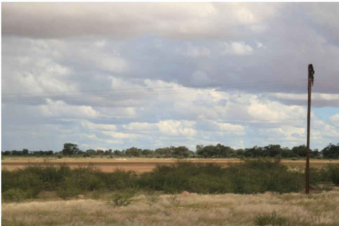
Figure 1. A large, well vegetated pan system, with water, is viewed as sensitive habitat (“high”).