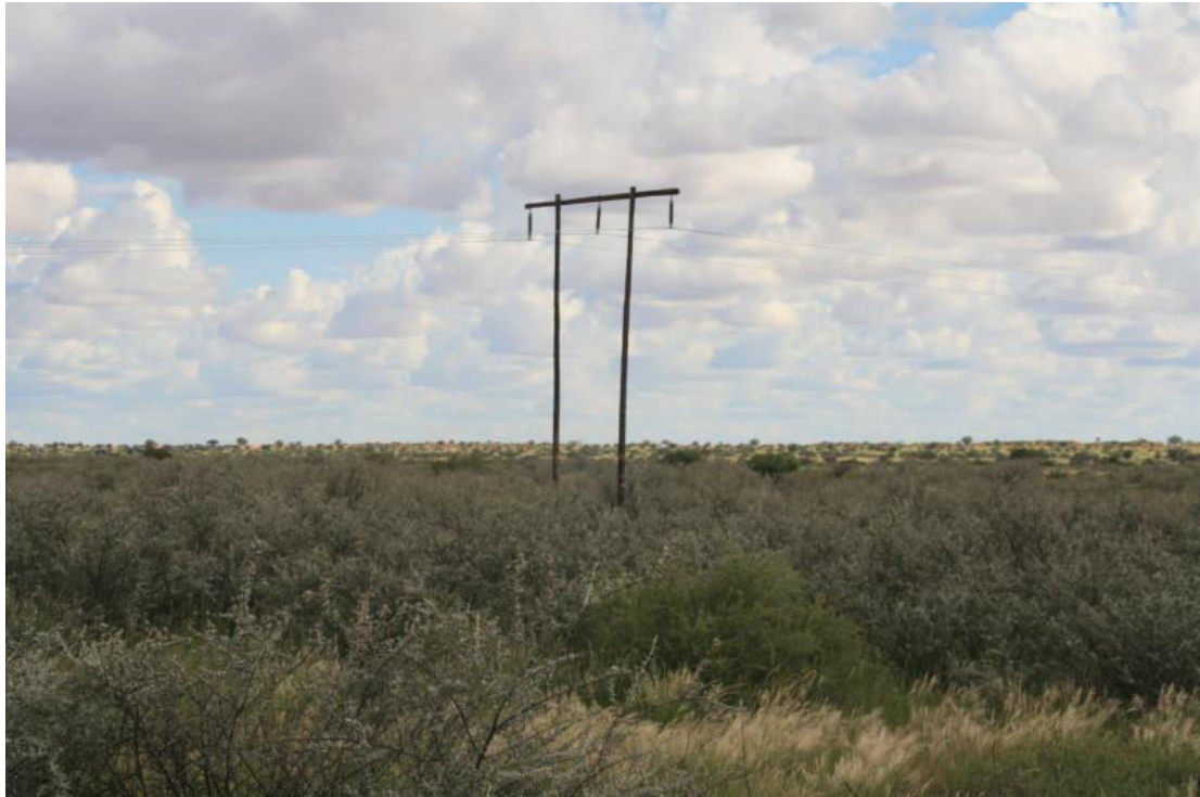
Figure 3. The dune streets are typically dominated by various densities of Catophractes alexandri (trumpet thorn) shrubs.