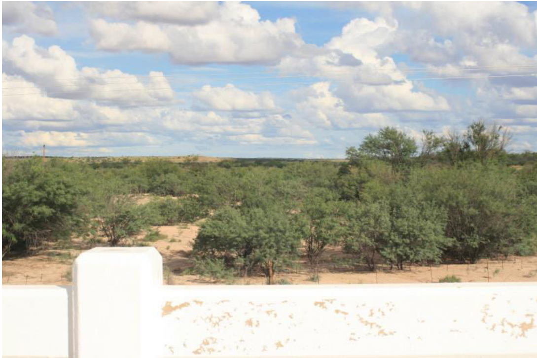
Figure 12. The ephemeral Auob River east of Stampriet is viewed as sensitive habitat (“high”) although heavily infested with the invasive alien Prosopis spp.