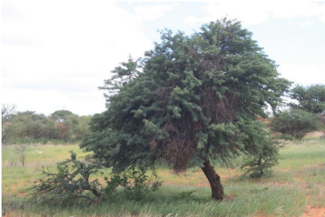
Figure 6. Albizia anthelmintica observed as individuals along the route.