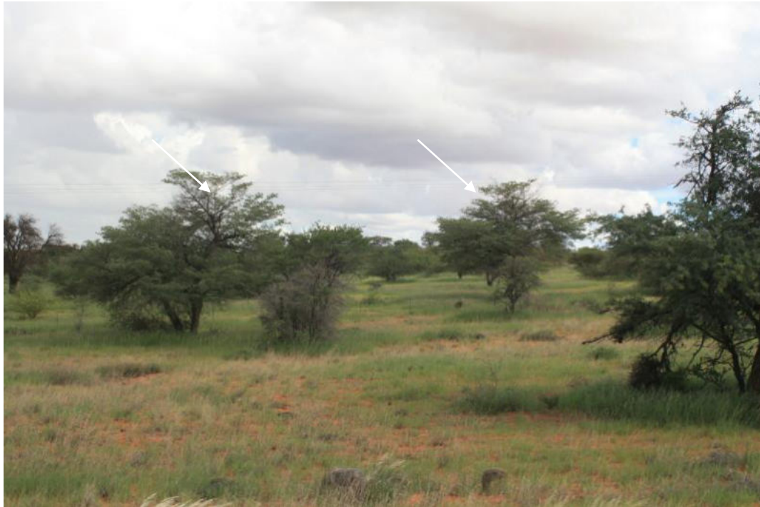
Figure 5. Individual large Terminalia sericea were observed along the route closer to Aranos (See arrows).