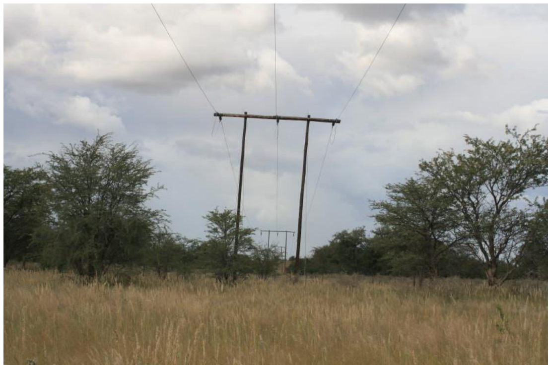
Figure 4. Some Vachellia erioloba (camel thorn) trees beneath the line.