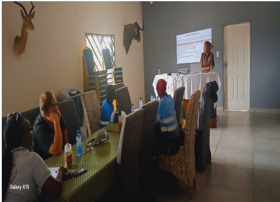
Figure 1: Arranged public meeting at Farm Abenab

The public consultation held on Friday, 4 April 2025, at Farm Abenab achieved 50% attendance (2 out of 4 expected representatives). Farm Abenab and Starnberg were directly represented by their owners, while Cleveland Land was represented by the same individual acting on behalf of Farm Abenab due to the Cleveland owner's absence. Auritsab remained unrepresented. Despite prior notification via WhatsApp groups and newspaper advertisements, the partial attendance highlights the need for direct follow-ups with absent stakeholders and hybrid engagement formats (e.g., virtual options) to ensure inclusive participation in future consultations