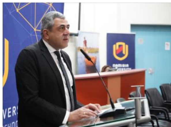
Sustainable tourism... Zurab Pololikashvili, Secretary General of the United Nations World Tourism Organisation.

His public lecture outlined his role in establishing a crisis response team at UN Tourism to drive the global recovery of the tourism sector in the aftermath of the pandemic, a process that began with a visit to Namibia in 2020. He further underscored his commitment to people-centred leadership, emphasising the need