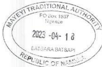
Shikati B.L Shufu