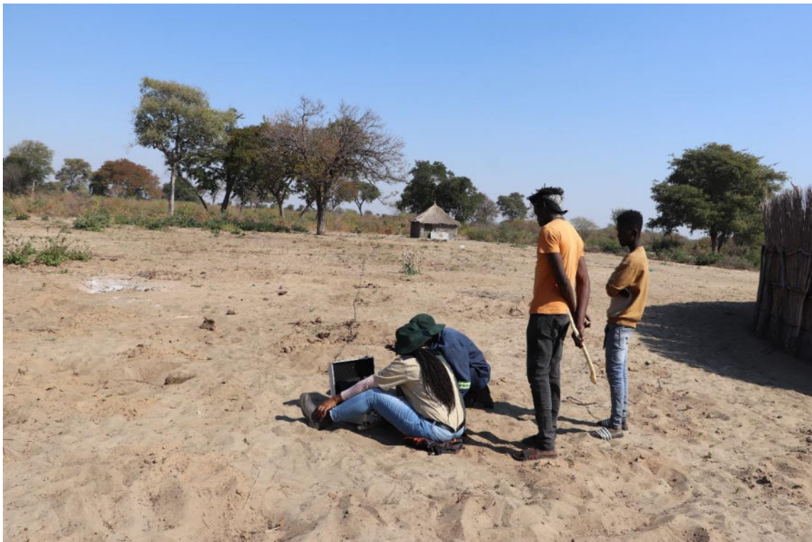
Figure 4. Shatunda Site Assessment

The Shatunda project is located within the Wuparo Conservancy in the area of Samudono (Figure 4). The area for the borehole installation is already cleared for settlement and no further vegetation clearing will take place.