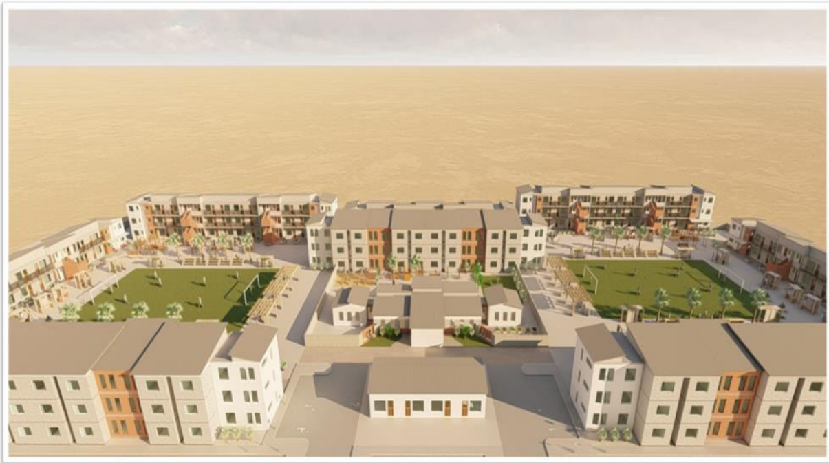
Figure 12:4: The Concept depicts an Aerial view of the proposed development (credit: Lötter Krogh Architects, 2020)