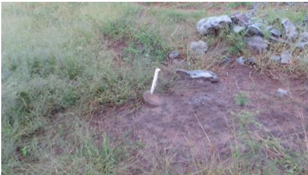
Figure 1. RC drill hole after rehabilitation (Image for illustration purposes).

Additionally, waste dumps containing biodegradable materials must be backfilled to prevent environmental degradation. Any pit latrines constructed during the exploration period should also be properly closed and rehabilitated to ensure that they do not pose health or environmental risks. Moreover, all infrastructure built for exploration purposes should be dismantled or repurposed where feasible, ensuring that the site returns as closely as possible to its original state.