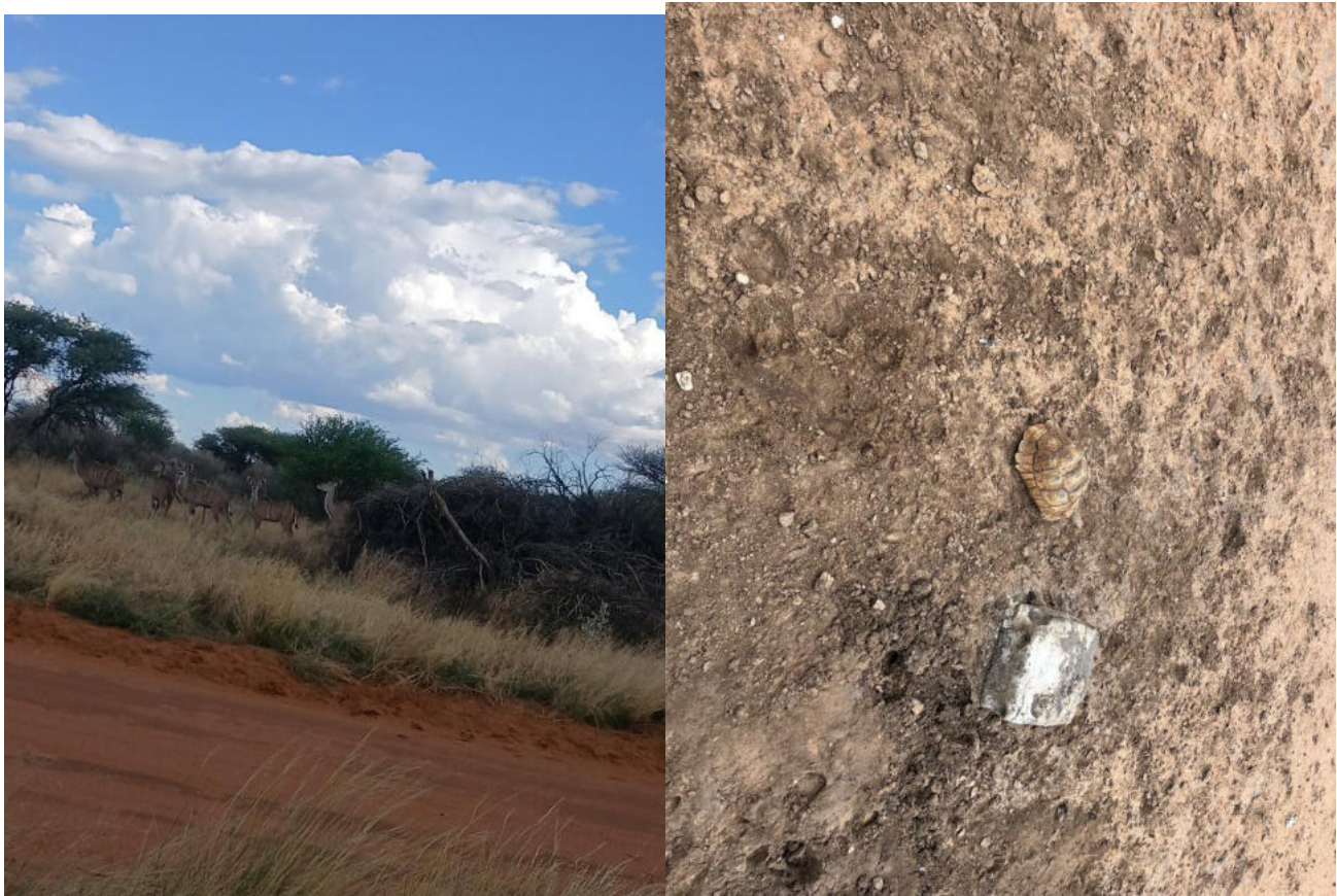
Figure 5-2 Species in project area