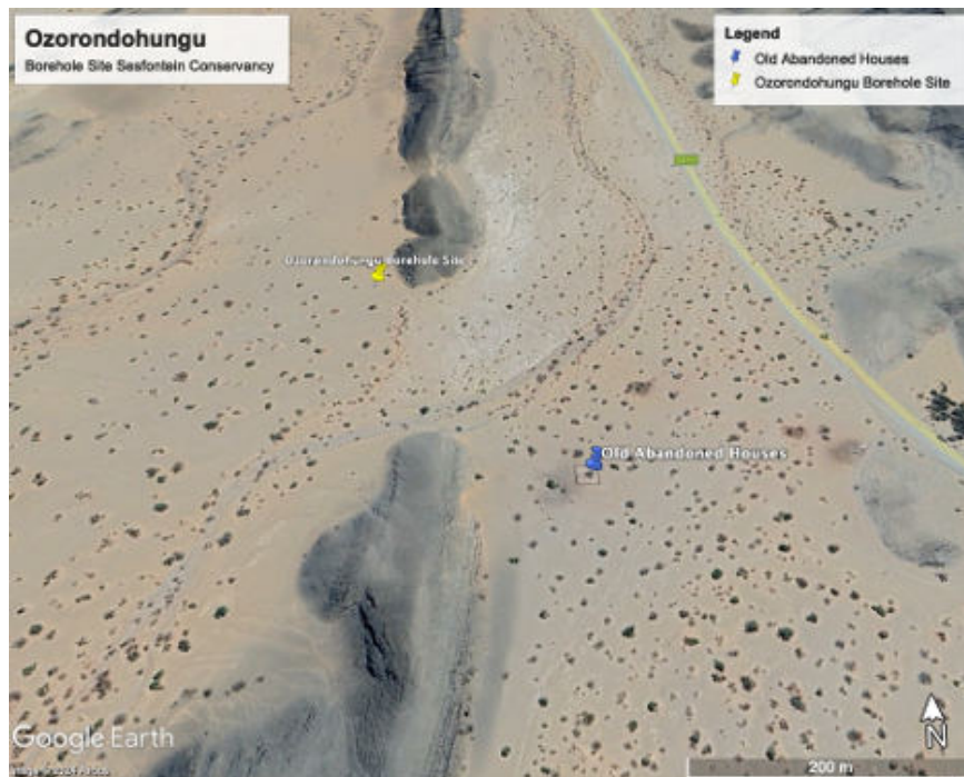
Figure 2. Aerial view of Ozorondohungu Borehole site