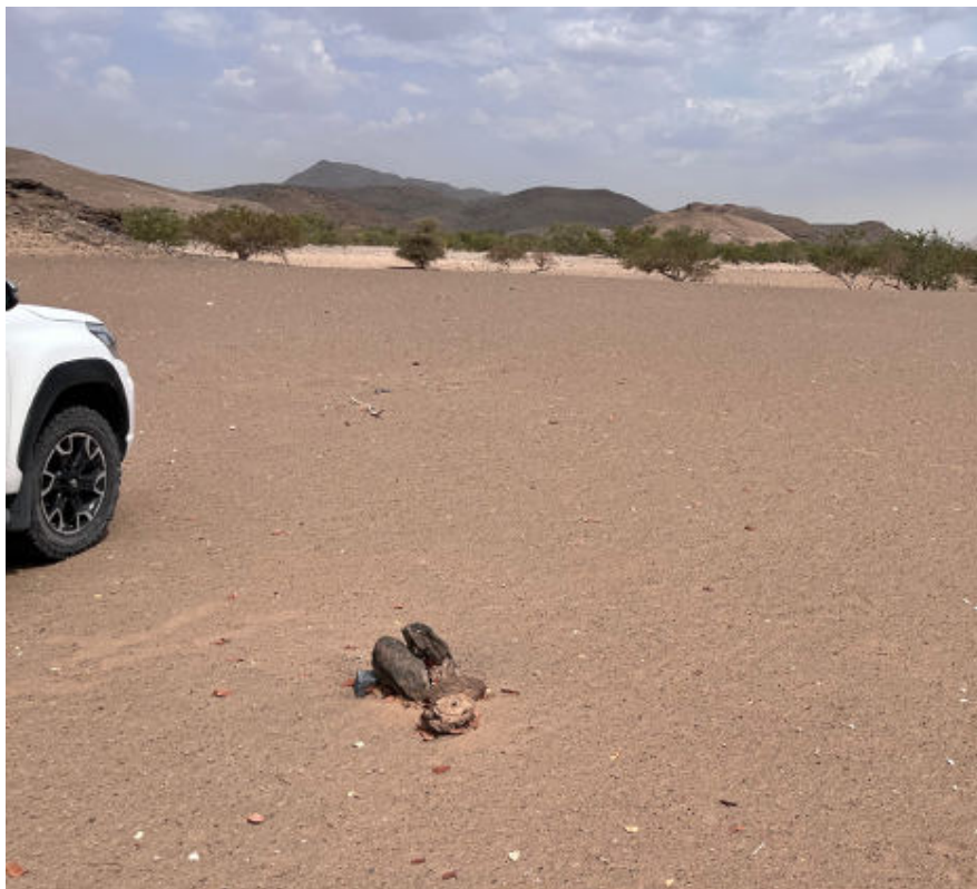
Figure 3. Ozorondohungu Borehole site (pile of rocks)