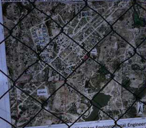
PROPOSED POWERCOM TELECOMMUNICATION TOWER- EHEKE LOCALITY MAP

PowerCom (Pty) Ltd (the proponent) proposes to erect a telecommunication tower in Eheke, Oshana Region. The location of the proposed site is indicated below.