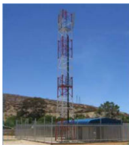
Figure 1: Example of lattice network tower erected by PowerCom