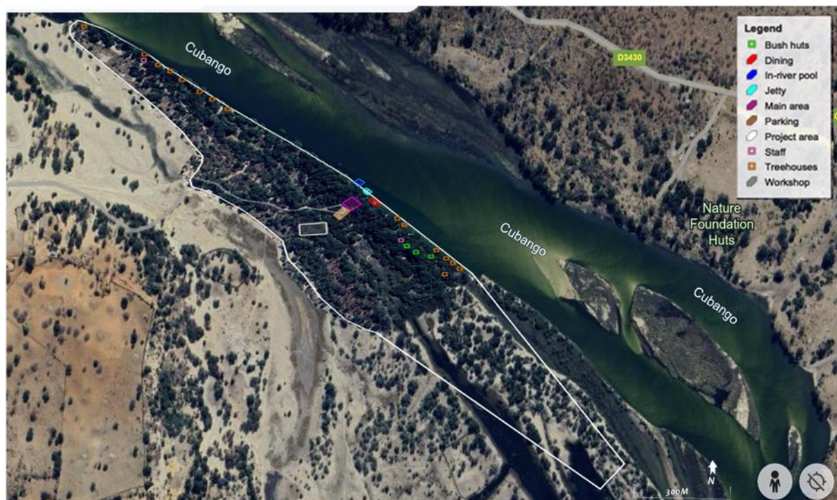
Figure 2. Layout of infrastructure

The layout of the infrastructure on the site is shown in Figure 2.