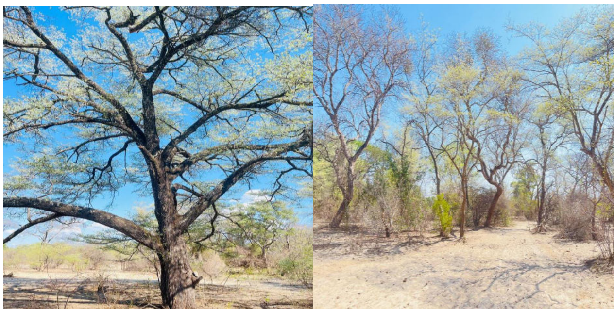
Figure 2: Common vegetation found around the proposed site

From the site assessment, the area is mainly dominated by large trees of Terminalia sericea , Burkea Africana , Albizia versicolor , and combretum species. No red data or endangered species were noted/recorded during the site visit. The removal of any trees, however, will have to be done following careful management measures as documented herein.